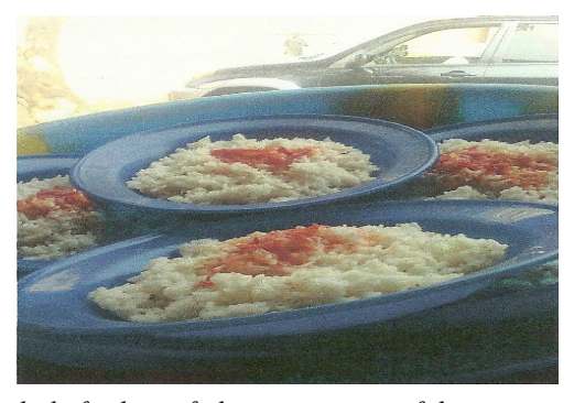
daily feeding of almajirai in one of the center