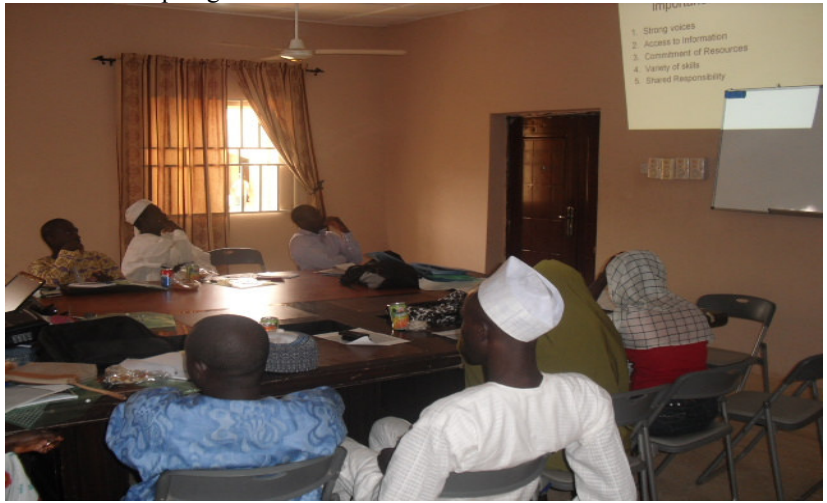
CSOs and government partners held one day meeting on guideline for freedom of information act

CSACEFA conducted meeting in collaboration with and EPM to disseminate and sensitize government and CSOs stakeholders on the developed guidelines on freedom of information act. This is contributing to Result