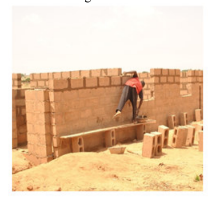
community responding by providing land and building almajiri integrated learning center in Shagari

Supported CC to implement programs in 2 LGAs of Shagari and Alkaleri where they activities such as Advocacies and sensitization in support OVC and girls education, monitoring of NFLCs, KFs and AGPs in 20 communities on Girl child enrolment and OVC support; Conducted joint advocacy to follow up on the posting of permanent teachers to NFLCs in Bauchi and Sokoto, 20 teachers have been posted. FOMWAN supported implementation of literacy/numeracy in 8 NFLCs in Alkaleri and Shagari LGAs with 320(188m-132f)