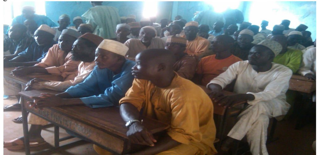
CROSS SECTION OF CAREGIVERS RECEIVING TRAINING ON HH ECONOMIC STREGTHENING As part of CSACEFA sub-grant activities was establishing and managing Almajiri integrated Centers which are called Non-formal Learning Centers in 4 areas of Bodinga local

CSACEFA Participated in Training of Trainers (ToT) of caregivers organized by OVC WA. In year 2-4 CSACEFA Conducted training for 1,976 caregivers of OVC on House Hold Economic strengthening this activity is linked to Sub result 2.2.4: Capacity of Communities and Caregivers to support OVC education and well being built.