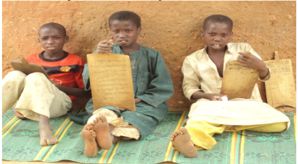
These 3 leaners are now in Formal primary schools in Boginga and Sifawa town