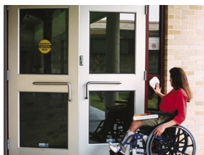
Figure 4: Buttons are easy to tech (Doorconcepts, 2013).