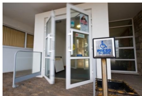
Figure 3: buttons can hang out side (The automatic, 2013).