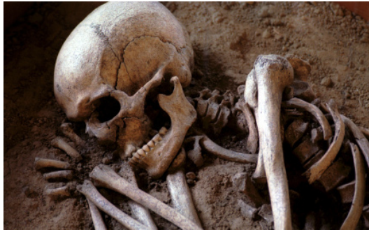
Figure 1 remaining for a killed disabled (Chew,2012).