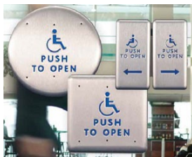
Figure 2: Shapes of buttons (Sweets, 2013).