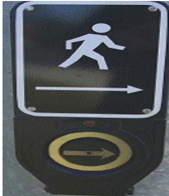
Figure 5: Pushbutton-integrated APS (Barlow, 2009).