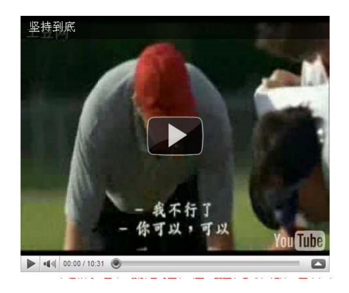
Figure 3: Print screen of the video clip (Group B).