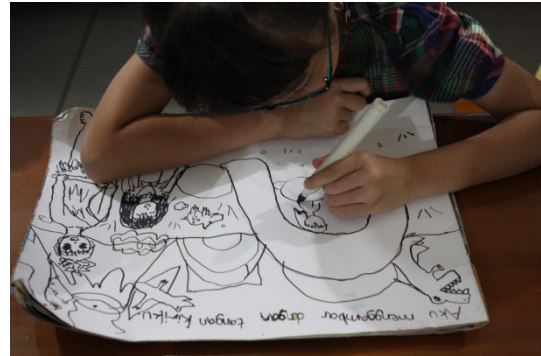
Figure 1, 2. Experiment drawing with left hand