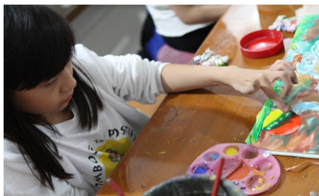
Figure 12. Coloring Stage