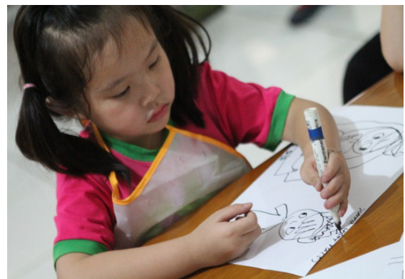
Figure 5,6. Experiment drawing with another left hand