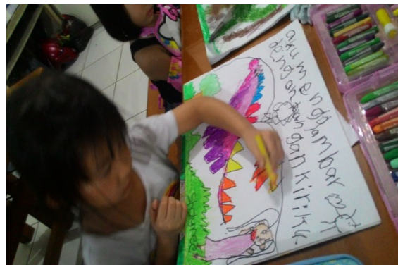
Figure 9,10. Coloring Stage