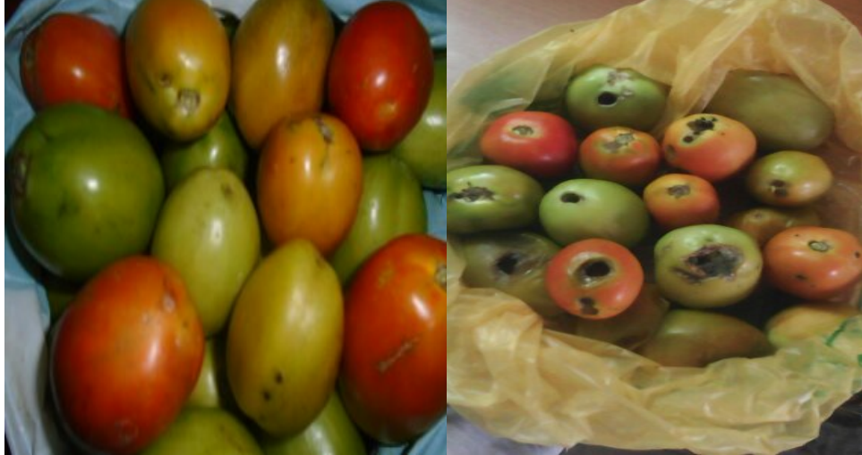
Non- infested fruits