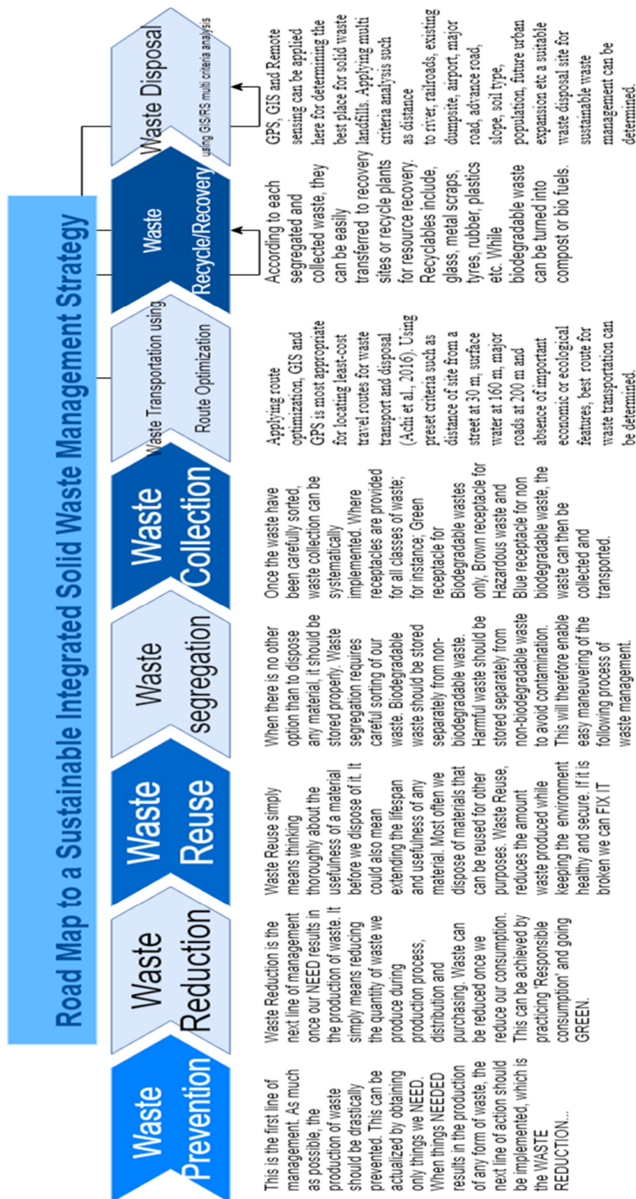
Fig 3: showing a road map to a sustainable integrated solid waste management strategy. The Fig 3 above synchronized all waste management strategies, that, in one way or another, is employed by the Waste Authorities in Nigeria. Drawing from the rich benefits of the WMS to both the environment and the