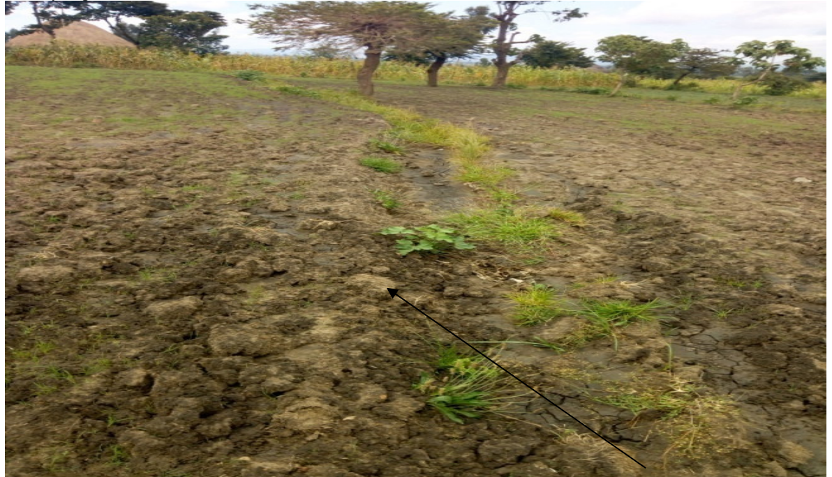
Figure: Soil and water conservation bunds destructed to increase crop land size at Mirab Gortanicho kebele, Wera Zuria woreda.

Conservation activities due to social, economical, environmental and political factors. Some of the major factors reported were: Land size: it is closely associated with soil fertility and soil erosion perception of farmers thus farmers with large farm holding perceive soil erosion better than those with smaller one. They practice traditional fallowing and also allot enough plot of grazing land for their cattle that help to mitigate soil erosion and fertility depletion.