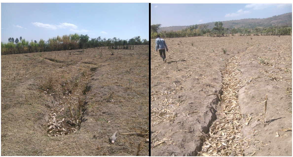
Figure: Physical structures which were not well designed on farm lands at Tankaka Umbullo kebele.