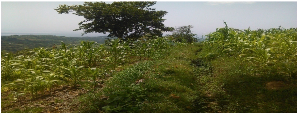
Figure 2: soil bund constructed and stabilized on farm lands at Tuttiti Kebele Fanaju bund

This bund also was constructed on farm lands by watershed management public complain work. It was done by designing and excavating a line between two points along the contour and throwing the excavated soil above the ditch. This structure was constructed on the lands with the slope of 3-50%. The dimensions were similar with soil bund that means it was 10m length, 30-70cm width, 30-60cm depth, 20-25cm burm width, 40-60 embankment height and 30-50cm embankment width. This was done; to conserve moisture, to increase soil infiltration rate, to reduce erosion by minimizing runoff velocity and harvesting water on the ditch. (Source: survey data: 2019).