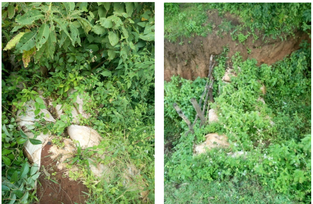
Figure 4: gully rehabilitation practice implemented at Layigna Arisho kebele by using sand filled sacks Gabion

This gully control measure was applied at Layigna Arisho, Kajima umbullo and Tankaka umbullo kebeles to rehabilitate large gullies. It was constructed by using stone and gabion mesh horizontally on the gullies. The implementation of this practice was to rehabilitate large gullies, to reduce run off velocity and use as a barrier for runoff on the gully. (Source: survey data: 2019).