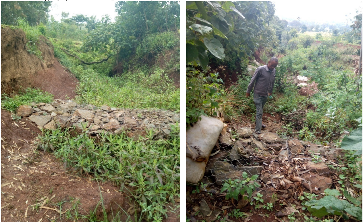
Figure 5: Gully rehabilitation practice at Layigna Arisho Kebele by using gabion Farm pond and Improved pit Farm pond implies the construction of water harvesting pond inside or near to farm field. In some extent this

This gully control measure was applied at Layigna Arisho, Kajima umbullo and Tankaka umbullo kebeles to rehabilitate large gullies. It was constructed by using stone and gabion mesh horizontally on the gullies. The implementation of this practice was to rehabilitate large gullies, to reduce run off velocity and use as a barrier for runoff on the gully. (Source: survey data: 2019).