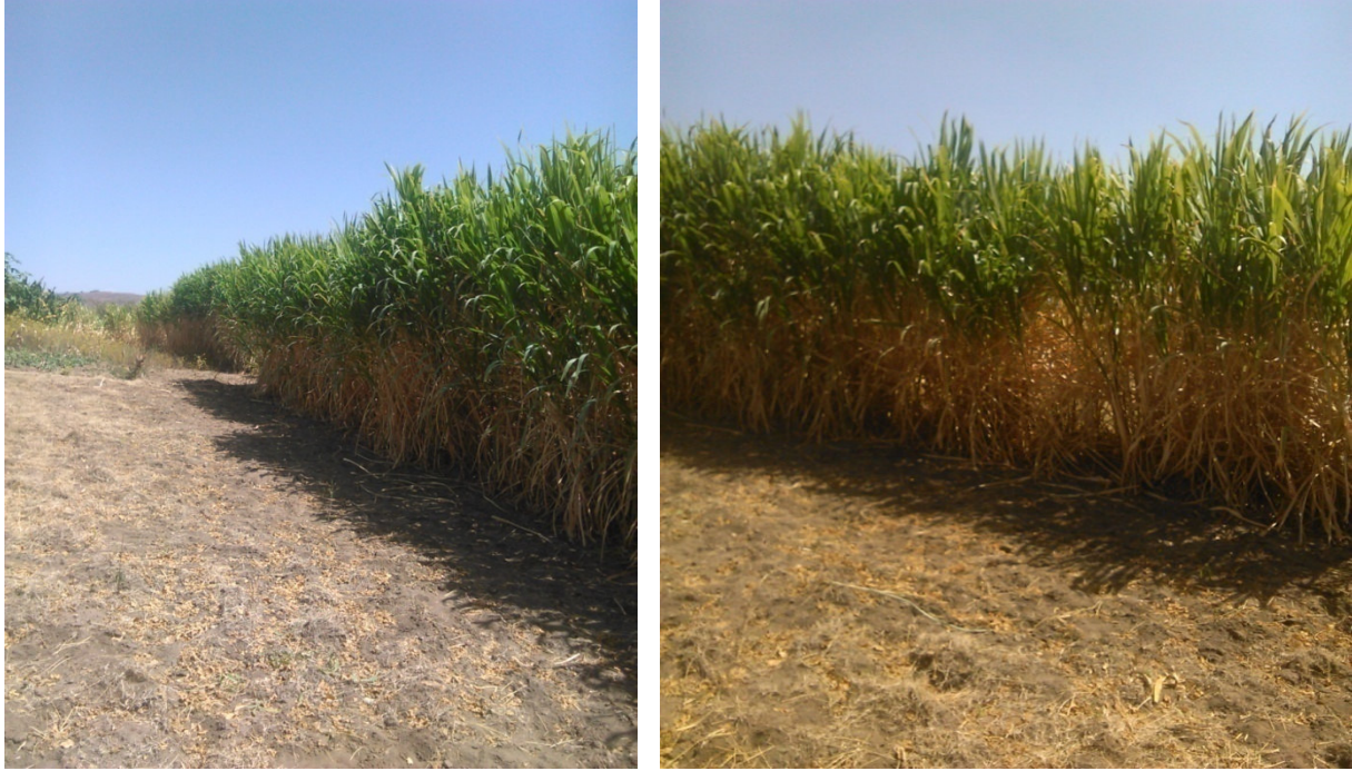
Figure 6: Elephant grass strips planted at tankaka umbullo kebele, Hawassa Zuria district.

Planting of grasses horizontally on farm lands along the contour was common at Kajima Umbullo kebele. Both elephant and desho grasses were used to plant grass strip on the farm land to control erosion. According to the respondents the practice was important to control soil erosion by reducing rain drops effect and reducing runoff velocity. In addition to erosion controlling effect it was good source of forage for animals. (Source: survey data: 2019).