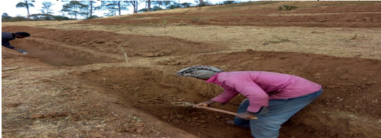
Figure 3: Fanaju bund constructed on farm lands at Tuttiti kebele Trench bund

This bund also was constructed on farm lands by watershed management public complain work. It was done by designing and excavating a line between two points along the contour and throwing the excavated soil above the ditch. This structure was constructed on the lands with the slope of 3-50%. The dimensions were similar with soil bund that means it was 10m length, 30-70cm width, 30-60cm depth, 20-25cm burm width, 40-60 embankment height and 30-50cm embankment width. This was done; to conserve moisture, to increase soil infiltration rate, to reduce erosion by minimizing runoff velocity and harvesting water on the ditch.