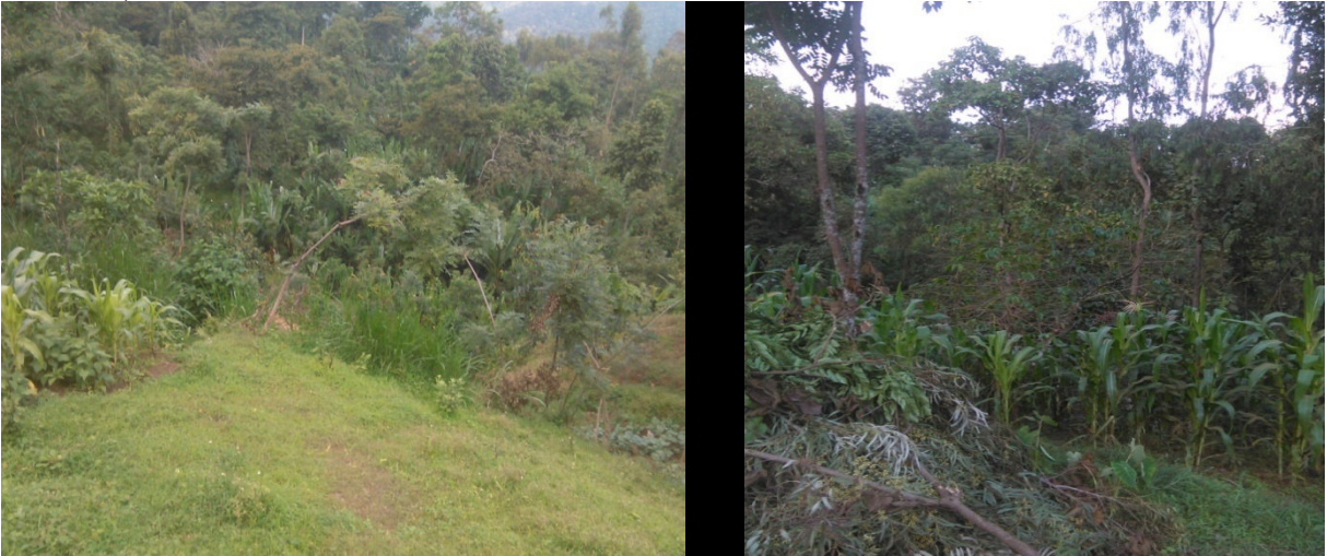
Figure 2: Agro-forestry practice at Tuttiti kebele, yirgachafe district Traditional pit

Farmers of the study areas practiced the planting of annual crops inside perennial trees on specified plot of land. Especially, At Tuttiti and Worabi kebeles the were the areas from well known agro forestry system practiced areas of the region .They plant enset, maize, pea, bean, barley, wheat and others inside perennial trees. According to the respondent's attitude the farming system were practiced; to provide two or more outputs, to reduce nutrient competition, to reduce disease, to improve soil nutrient content and to increase land productivity. (Source: survey data: 2019).