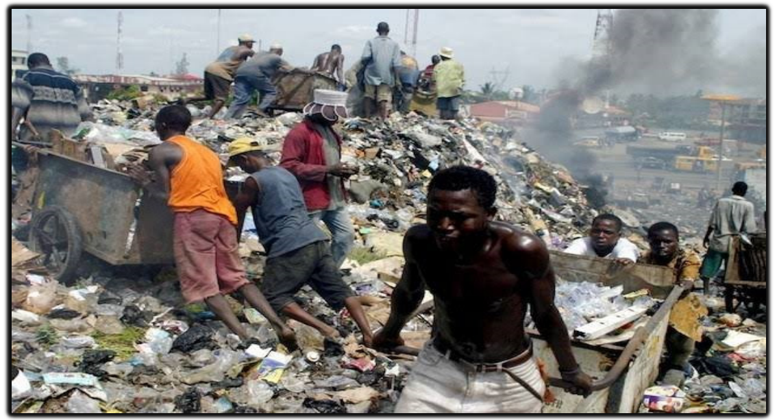
Figure 2: The activities of some of the cart pushers and scavengers on Olusosun dumpsite

Despite the complaints about the effect of the dumpsite on the livelihood of residents around, the findings revealed that residents around the dumpsite obtain a certain benefit from the dumpsite, majorly scavenging. Majority of the respondents indicated that they have seen many people pick items (plastics and metals) from the dumpsite. A large percentage of people who scavenge for items from the landfill clearly show the lucrative nature of scavenging to people. 61% respondents stated that, at least below $2,000 was earned on a daily basis for scavenged items. Usually, money is paid in exchange for scavenged materials, depending on the weight (kilogram). Precisely, about $60 and $100 is paid per kilogram for plastic and metal items respectively.