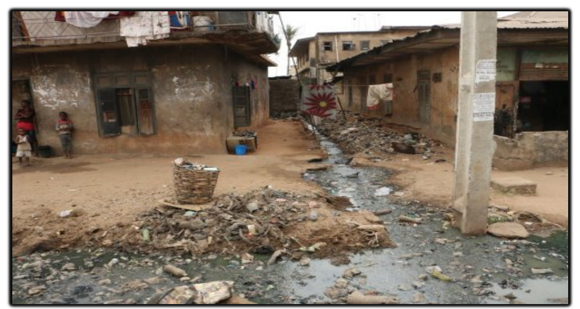
Figure 4: A cross-section of substandard residential buildings in unhygienic environment around the Olusosun dumpsite