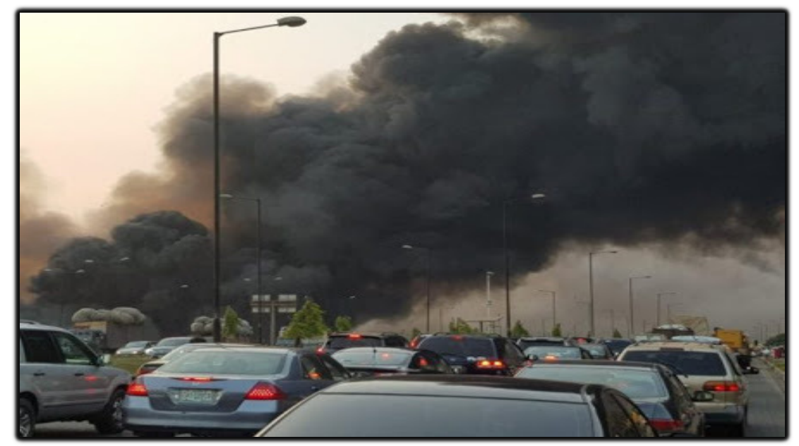
Figure 3: Environmental nuisance caused by tick and hazardous smoke emanating from the Olusosun dumpsite leading to serious air pollution