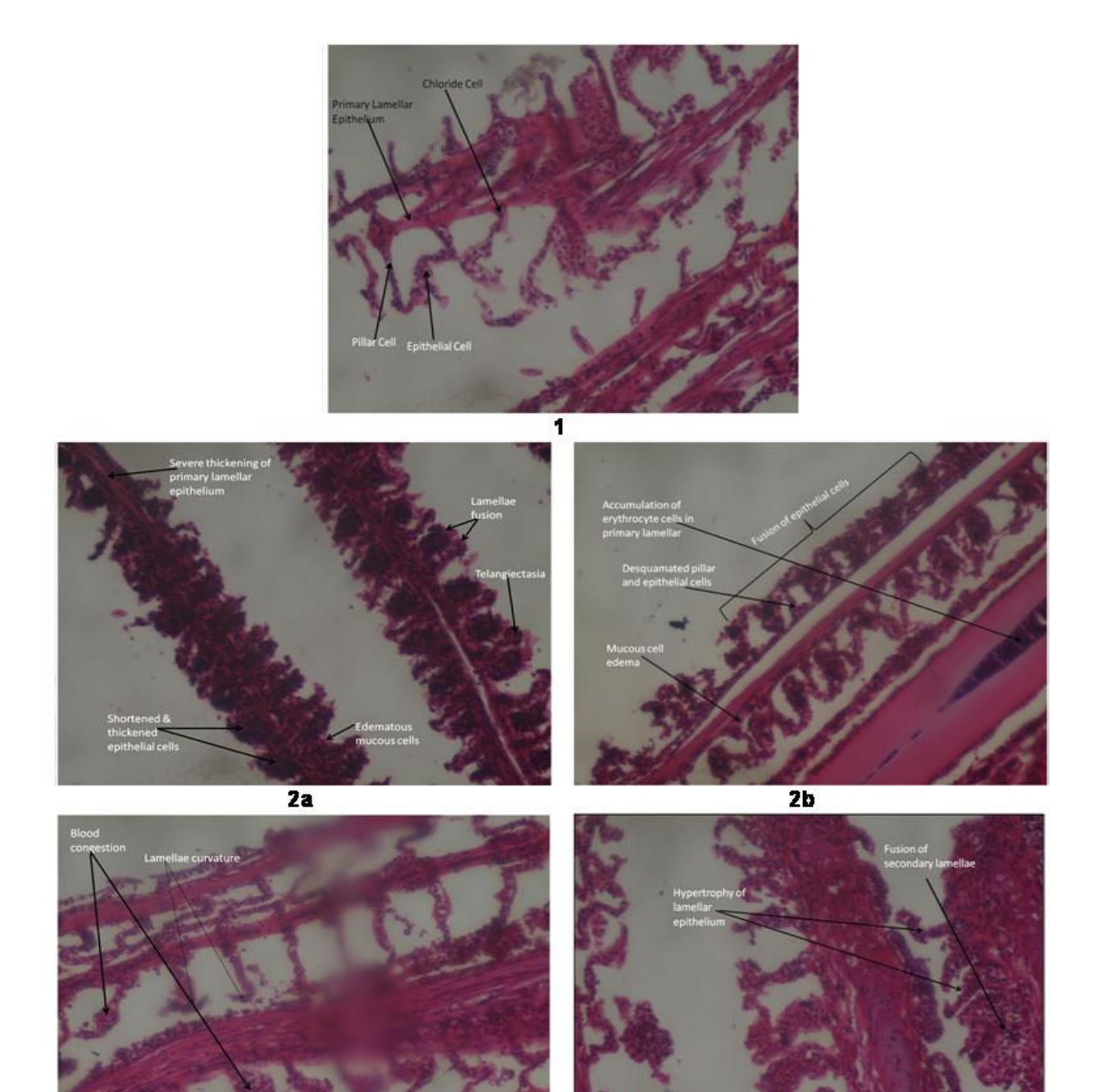
Figure 6: Effect of mixed effluent on gill histopathology of tilapia fishes

changes characterized by epithelial lifting were observed in gill filaments and secondary lamellae (Plate 3b). Moreover, aggregation of inflammatory cells, dilation and congestion in blood vessels were observed in gill filaments. Atrophy of second lamellae was also noticed (Figure 6).