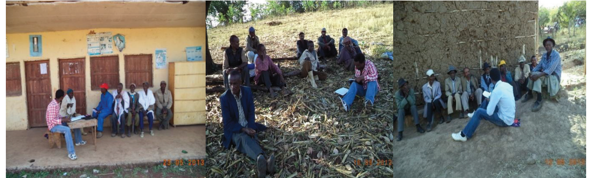
Figure 1: FGD in the highland

For FGD individuals who had long period of experience in farming were selected to discuss specific issues related to climate change and variability. The issues included as to how farmers characterize the weather of their area in terms of temperature and precipitation, what was the local indicators they use to perceive long term change in climate and the major climate related impacts they experienced in the area over the last two decades. Thus, one FGD that consisted six up to eight persons, were held in each kebele (e.g. see the photo below). These make up a total of three FGD for the purpose of triangulating the information from the sources.