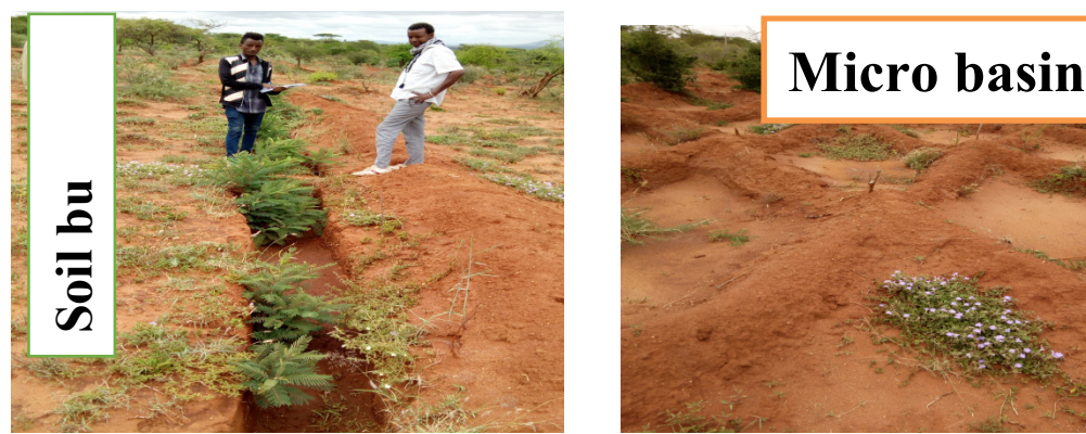
Figure 2.Soil bund and Micro basin in the study area