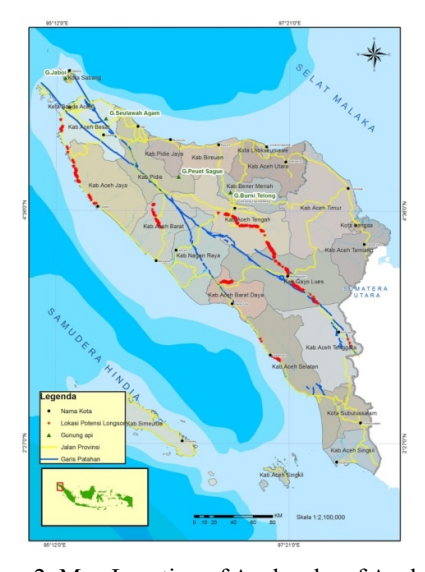
Figure 2. Map Location of Avalanche of Aceh Province