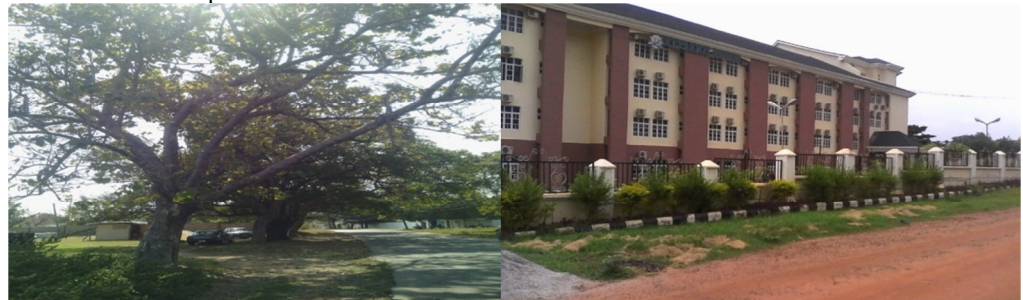
Plate1: Images of parts of GRA/New layout with green cover in Lokoja

Locations with vegetal elements like trees and other green cover tend to have lower temperature values and as a result of this, human (thermal) comfort is likely to be higher in neighbourhoods with trees and other vegetation. The mean monthly temperature for the entire town compares favourably with the disaggregated values for sampled neighbourhoods. Thus while the lowest value for the sampled neighbourhoods being 27.25<sup>o</sup>C that of the monthly average obtained from Nimet is 25.9<sup>o</sup>C. It is important to note that whatever minor variation observed between the overall monthly temperature values and those obtained from the sampled neighbourhoods may be due to variation in the length of time for the recorded observations. The experimented temperature record did not factor in night temperatures which may have lowered the values obtained from Nimet. Despite of this fact, the overall implication of this finding is that close and positive relationships tend to exist between community of tree elements and ambient air temperature. So that neighbourhoods in the town characterized with presence of trees would constitute city resilience elements. A good example is the image of some neighbourhoods as seen on plate 1.