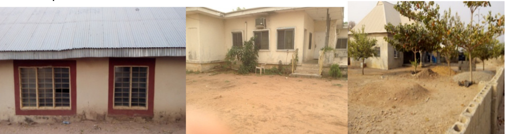
Plate 3: Samples of buildings with extra-large window sizes and deliberate tree planting.

Observed local coping strategies or measures to reduce the micro and meso scale climatic effects in urban Lokoja neighbourhoods are built around temperature and to a lesser extent rainfall. These strategies include life style modification (23.7 %), urban greening such as flower/tree planting, green cover and environmental beautification (59 %), and building modifications (16.9 %) particularly providing extra larger window sizes. See plate 3.