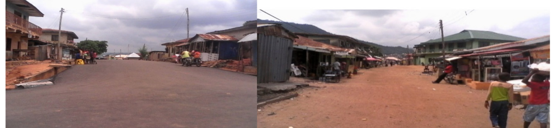
Plate 2: Images of parts of Cantonment and Kabawa/Galile in Lokoja

Generally, an environment or neighbourhood characterized with trees and green cover as seen on Plate.1 will have insolation received moderated by the trees and green element cover. This is the situation in the experimented sites/neighbourhoods of Lokoja like GRA/Newlayout, Lokongma, Adankolo, Felele and Otokiti/Zangodaji where temperature values were all found to be lower than 30°c. The human (thermal) discomfort would obviously be moderated when compared with the situation found in Cantonment, Kabawa/Galile neighbourhoods as seen on plate 2. An environment/neighbourhood on the other hand with scanty or no vegetation experiences higher temperature values. Unfortunately, due to many reasons that include but not limited to various human activities like house and road constructions, cutting of trees and grasses, absence of landscapes and others, the urban landscape/neighbourhoods of Lokoja are increasingly becoming green less environment, as every available space is built-up.