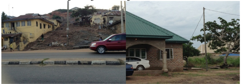
Plate 4: Pictures of buildings with conventional window height

The above pictures show buildings with extra-large window sizes and trees planted by individuals. In the buildings windows were inserted from the second or third block after foundation/base level. This being against the convention of inserting/cutting window from the fourth or fifth block as shown on plate 4, where the conventional windows on buildings are high above the ground and not so wide.