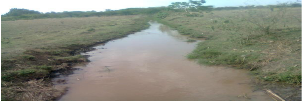
Figure 5: diverted River for crop cultivation

one which is called Blate. This hinders the use potential of irrigation through river diversion. During field observation, it was noted that river diversion used were responsible for water loss due to seepage and evaporation (Figure 5).