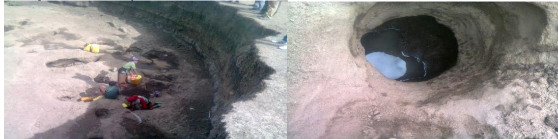
Figure 3: Women and children were searching for water (water shortage)

Hand dung well is also used by majority (68.4%) of farmers in the area (Table 1). The water from this technology used for both crop cultivation and livestock drinking purposes. Similar to motorized pump, it is public owned. The relative distribution of hand dung is higher than motorized pump since the area is located in the rift valley region where the ground water table is found at shallow depth and easy for extraction (Figure 3). The water from Hand dung well is free of charge. Due to its high availability (prevalence in the area) to farmers land, they use it for crop production. According to key informants' information, Hand dung well was originally designed for domestic consumption especially for drinking purpose, while the community uses not only for its designed purpose but also for agriculture. It is because of that the high shortage of water in the area. The others related study shows that Hand dung wells were common in Africa like Ghana and Ethiopia (Tsion, 2014). The same study proved that people use water from shallow dung well for domestic, livestock watering and irrigation, which is in line with findings of current study.