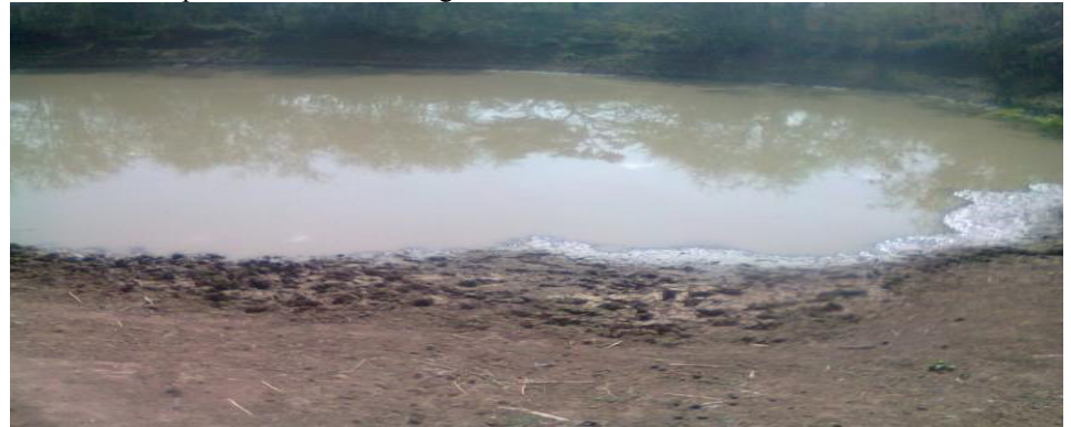
Figure 4: Water harvesting scheme in the area.

Water from rainwater harvesting is also other option for agricultural water use in the Halaba Special district (Figure 4). Rainwater harvesting was advocated by local government for the last two decades in the district. So far, the government has done huge investment for expansion of rainwater harvesting technology in the country at large and Halaba Special district in particular. In spite having the effort done by government, farmers who have adopted rainwater harvesting were the less number of respondents. This is because of that majority of the farmers were laggard to accept it, since the cattle's and children damaged by entering in the pond prepared for this purpose. Moreover, the FGD and Key informants stated that the expansion of malaria were the other reason that the farmers to resist to adopt rainwater harvesting in the area.