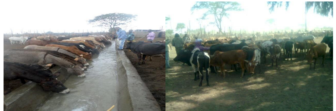
Figure 2: Livestock at water point extracted motorized pump

Hand dung well is also used by majority (68.4%) of farmers in the area (Table 1). The water from this technology used for both crop cultivation and livestock drinking purposes. Similar to motorized pump, it is public owned. The relative distribution of hand dung is higher than motorized pump since the area is located in the rift valley region where the ground water table is found at shallow depth and easy for extraction (Figure 3). The water from Hand dung well is free of charge. Due to its high availability (prevalence in the area) to farmers land, they use it for crop production. According to key informants' information, Hand dung well was originally designed for domestic consumption especially for drinking purpose, while the community uses not only for its designed purpose but also for agriculture. It is because of that the high shortage of water in the area. The others related study shows that Hand dung wells were common in Africa like Ghana and Ethiopia (Tsion, 2014). The same study proved that people use water from shallow dung well for domestic, livestock watering and irrigation, which is in line with findings of current study.