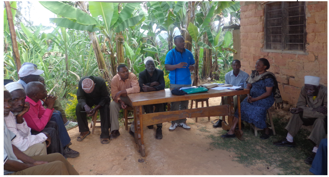
Figure 2: Awareness creation at Kwamboa irrigation scheme on water use related legislations, policies and regulations