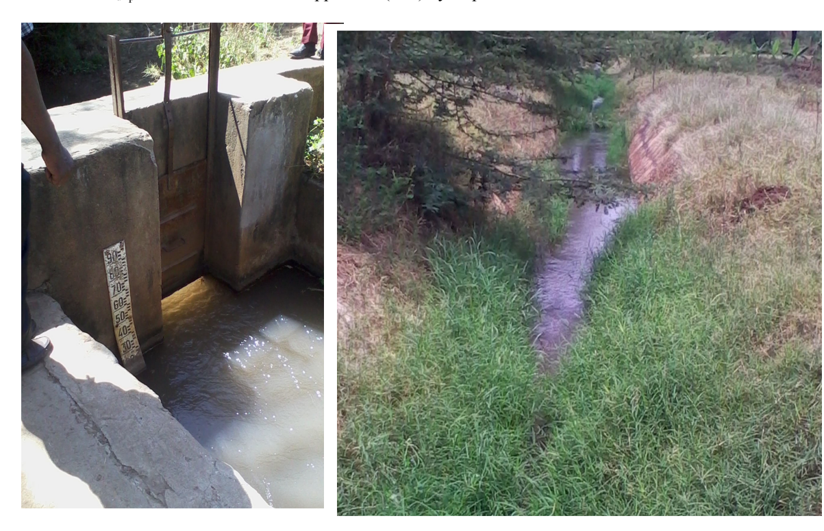
Figure 3: Flow measurement at Kimwangamao (Kisangesangeni) irrigation scheme for monitoring abstraction water from the river