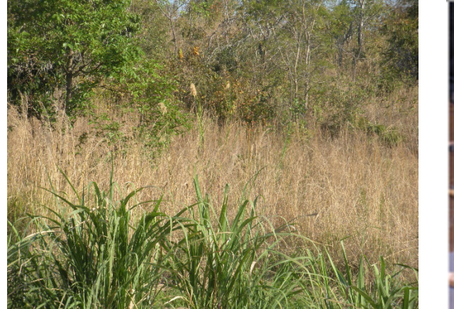
THE PATHWAY FOR MALAWI Open for trial and adaptation

This was then followed by what we called complimentary activities like tree planting where there is no tree root stock for natural forest regeneration, gully reclamation, ridge alignment in the cropped lands to reduced sheet erosion. The implications of this process with the communities were as follows : empowered the communities , allowed them to make decisions , implement them and to own the success etc. It also taught the communities to focus on a common goal and work towards it. It certainly brought confidence within the community that they could do things on their own. Although this worked in Malawi so well , we are not claiming that it is universal, each situation would need to be assessed to identify the key/ root challenges to be able to design a strategy around the the root causes of the degradation. Figures 3 and 4 show the achieved results using this pathway within 24 months, areas where re-forested and streams began to flow throughout the year.