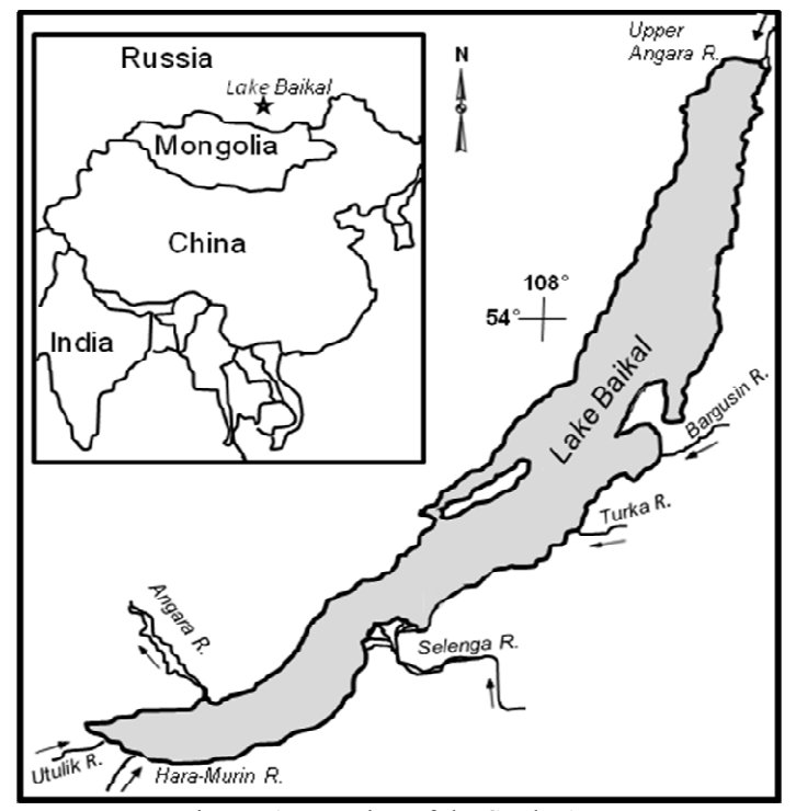
Figure. 1. Location of the Study Area.