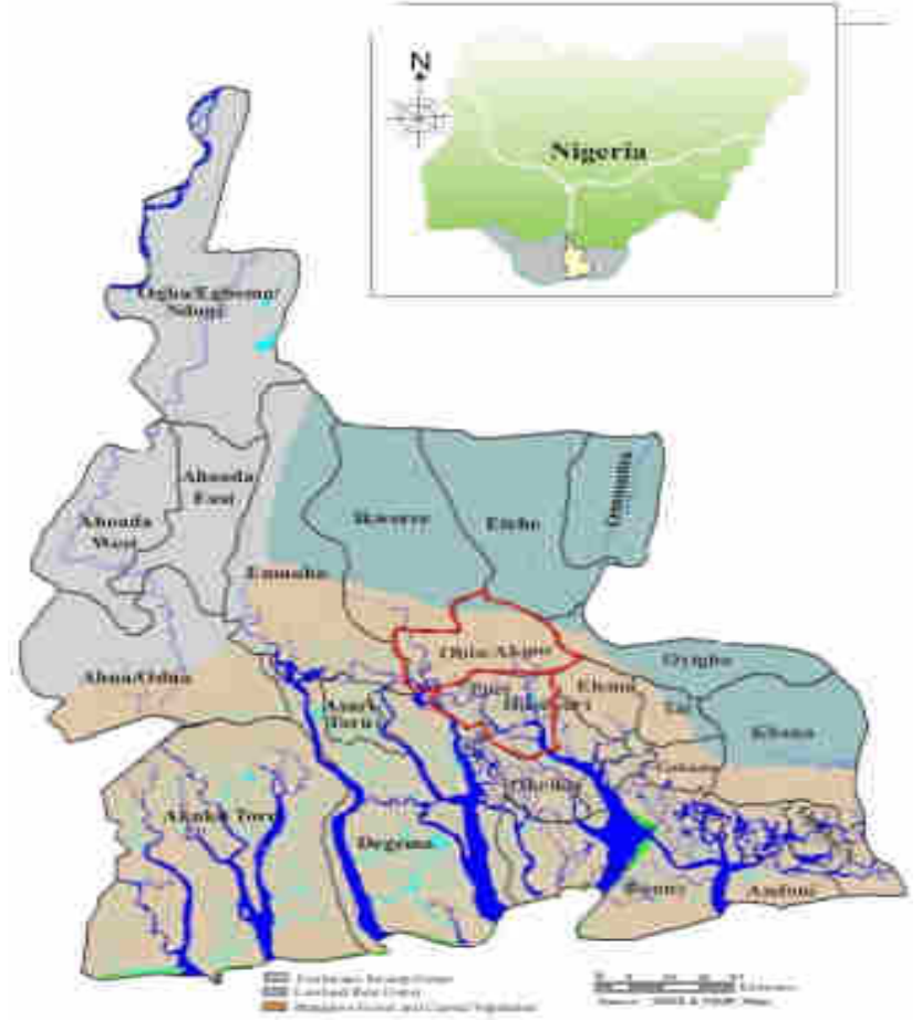
Fig. 1 Map of Rivers State Showing the study area