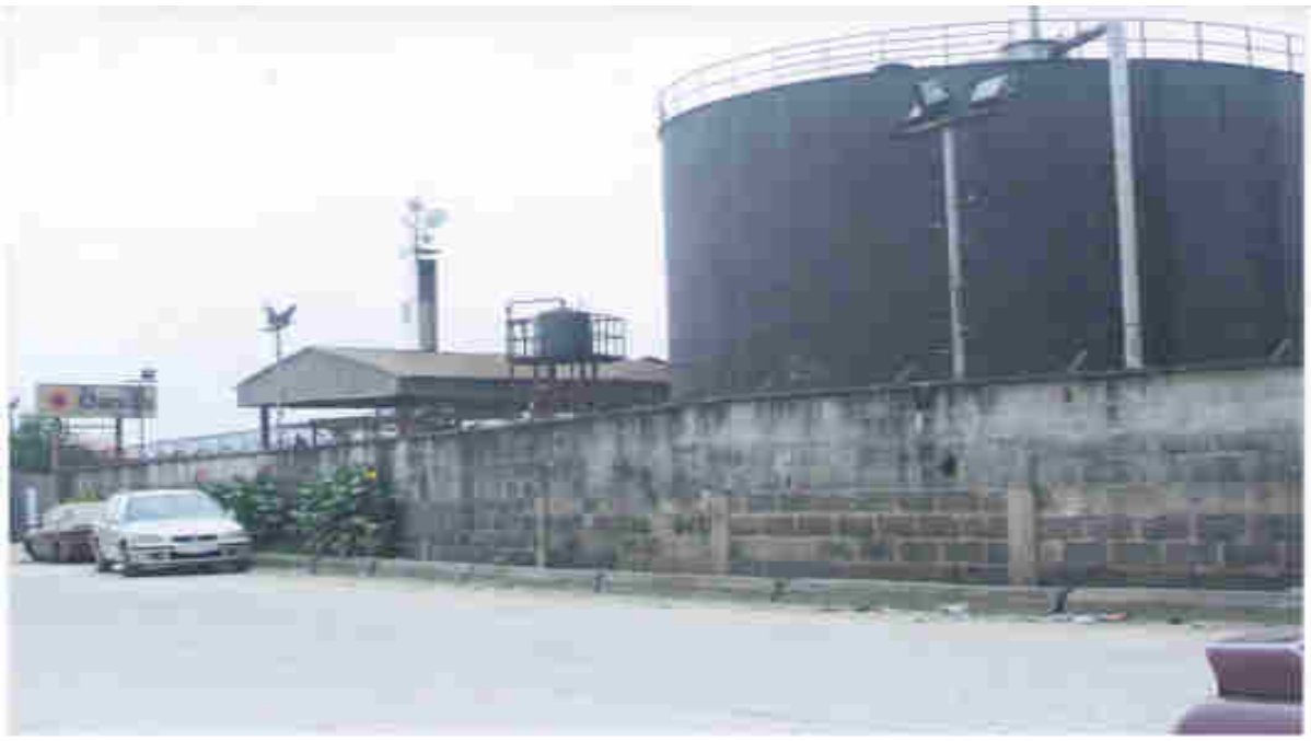
Figure 7: Premises of Petroleum Products Marketing Company in Bundu-Ama