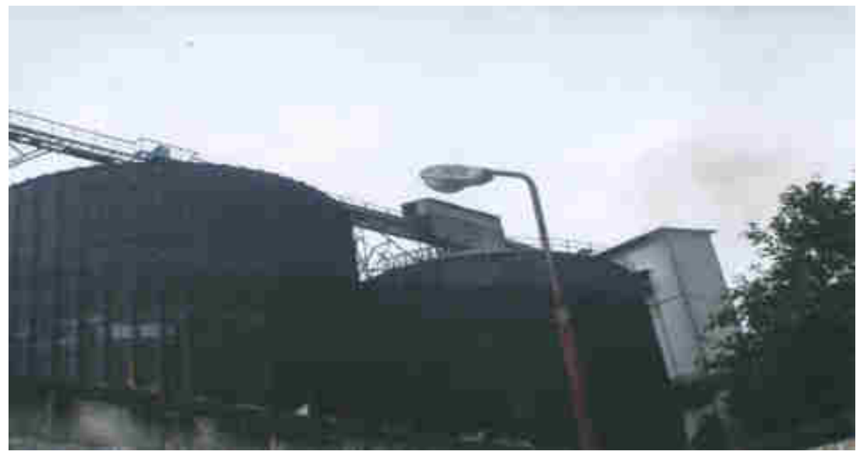
Figure 2: Gaseous Emission from a Chemical Plant in Bundu Ama