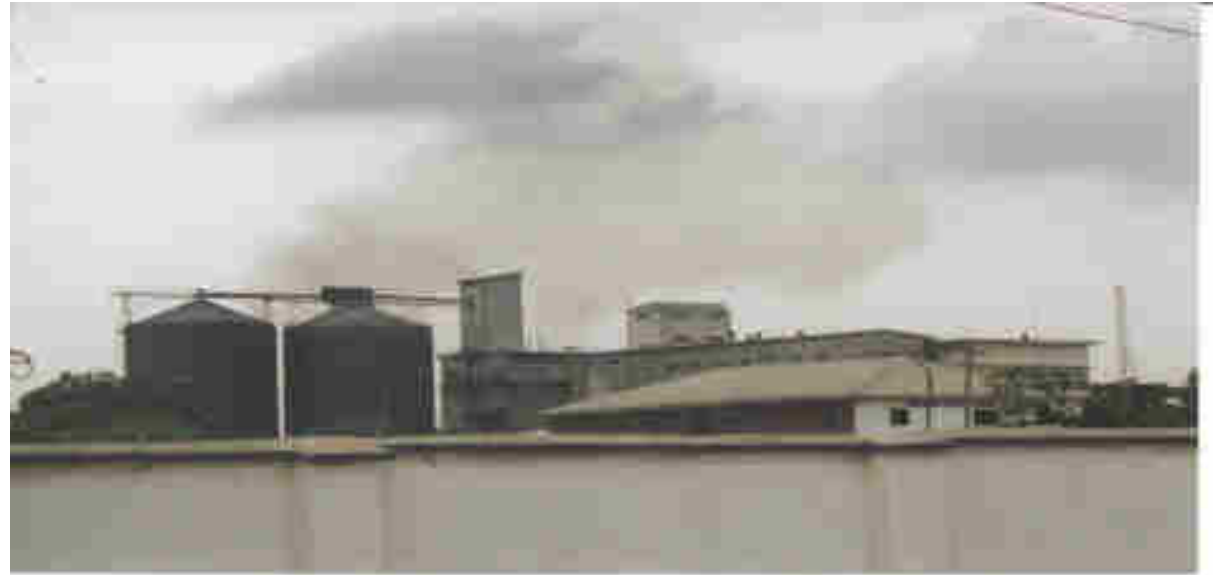
Figure: 1 Gaseous Emission from an Industrial Plant in Bundu Ama

The following air pollutants were monitored and measured at the various stations according to FMENV prescribed guidelines and methods; Suspended Particulate Matter (SPM), Carbon Monoxide, Hydrocarbon, Volatile Organic Compound (VOC), NOx and SOx.