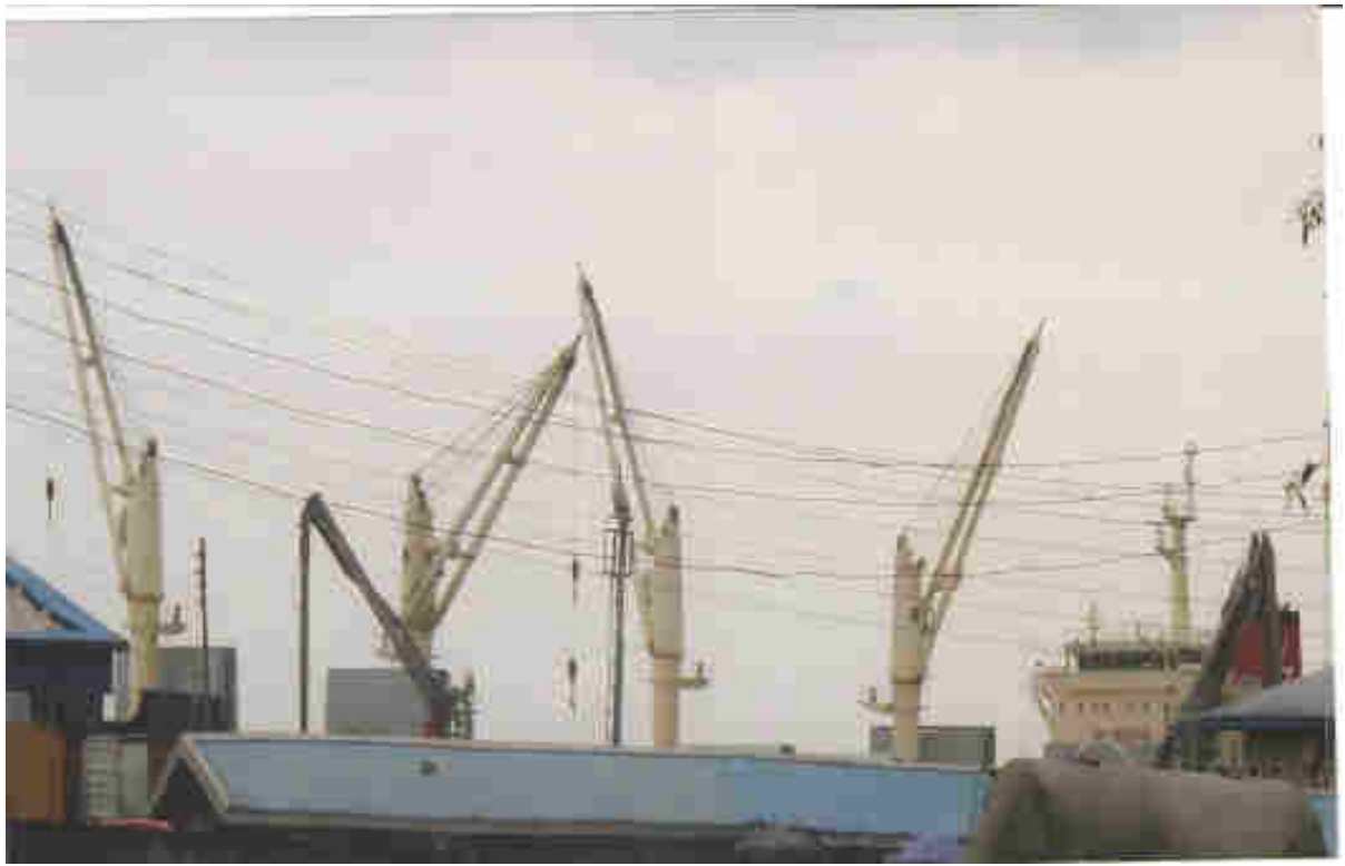
Figure 4: Jetty for Off-loading Gasoline and Diesel in Bundu-Ama