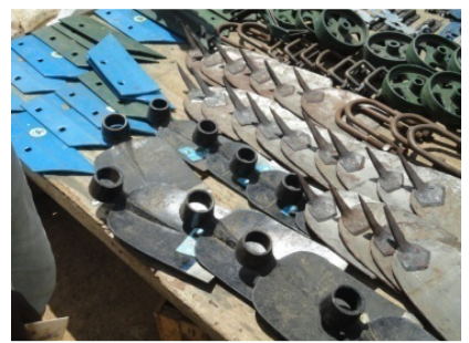
Figure 2: Markets enhance factor input mobility and access