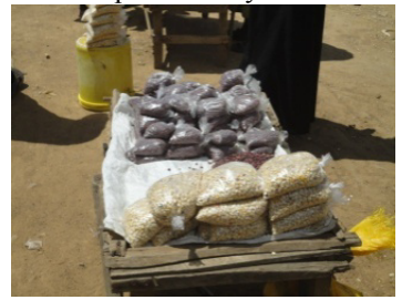
Figure 3 Figure 4