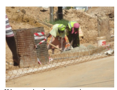
Figure 5: Women in the costruction sector