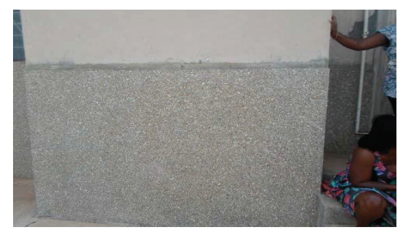
b) Terrazzo at the base of wall