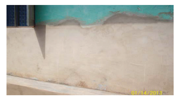
Fig 2 a) Aprons constructed together with replastering