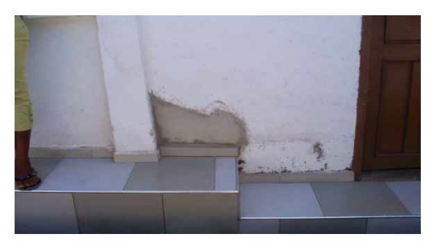
Fig 3 a) Tiled apron at the base of wall