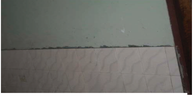
b) Base of wall tiled