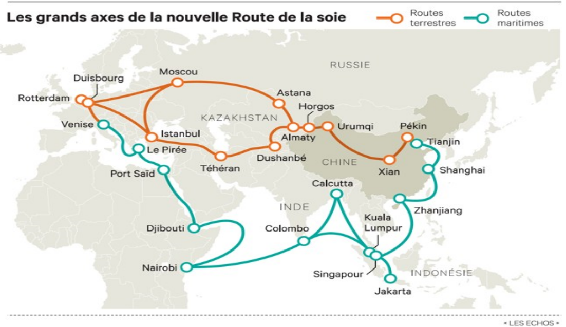
Figure 2: The main roads of the new silk and road

In November 2016, the Coca Codo Sinclair hydroelectric power station, built by China, was completed and put into use. The China-built Joint Laboratory of Ecuador Public Security Emergency Command and Control Center was inaugurated.