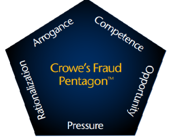
Figure 2.1 Pentagon Fraud

Corruption in RI Law No. 31 of 1999 concerning eradicating criminal acts of corruption states that "every person who is categorized as against the law, commits acts of enriching oneself, benefits oneself or another person or a corporation, abuses his authority or opportunity or means because of positions or positions that can harm the country's finances or the country's economy. "The Pentra Fraud Theory (Crowe's fraud pentagon theory) proposed by Crowe Horwarth (2011) states that competence, opportunity, pressure, rationalization, and arrogance are the causes of someone committing corruption (fraud) as the model in Figure 2.1. Competence or capability is the ability of employees to ignore internal controls, develop concealment strategies, and control social situations for personal gain. While arrogance is an attitude of superiority over the rights held and feels that internal control or company policy does not apply to him, these two dimensions of the causes of corruption that distinguishes from the theory of fraud previously proposed.