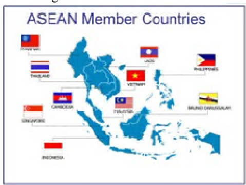
Figure 4 ASEAN 10 members

The ten member states of ASEAN have a combined population of 600 million. Put together, they are a large market. Among them, Indonesia is the most populous country with a population of 249 million, accounting for 40 percent of ASEAN's total population. It is also the world's fourth most populous country behind China, India and the United States