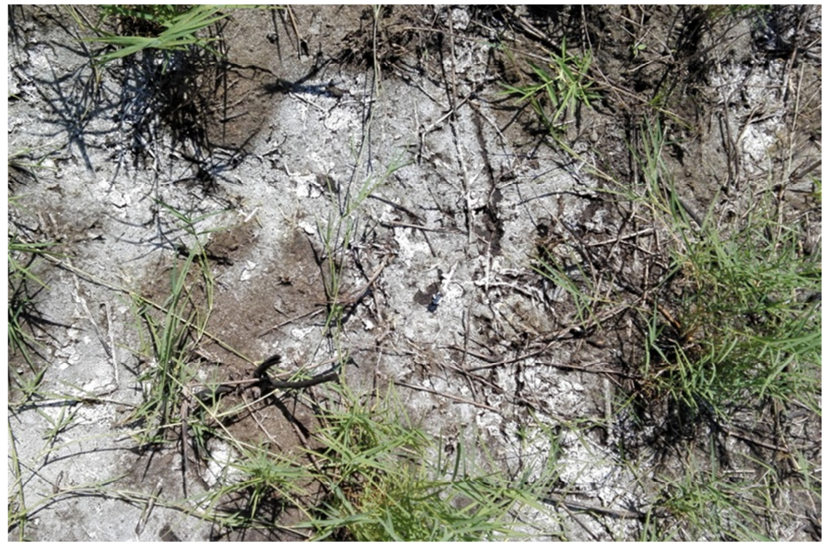
Plate 2.1: Saline soil in study area (Chanzuru, Kilosa)

Farmers' perceptions on salinity are defined by their understanding of factors influencing salinity and the consequences for crop production, and the way they judge the severity of the soil salinity for the fulfillment of their farming objectives in the light of the possibilities and constraints of their farming system (Kielen, 1996). Farmers' perceptions result from their knowledge of salinity occurrences, their farming experiences and salinity constraints. On the basis of this perception, the farmer defines a strategy to cope with salinity (Kielen, 1996).