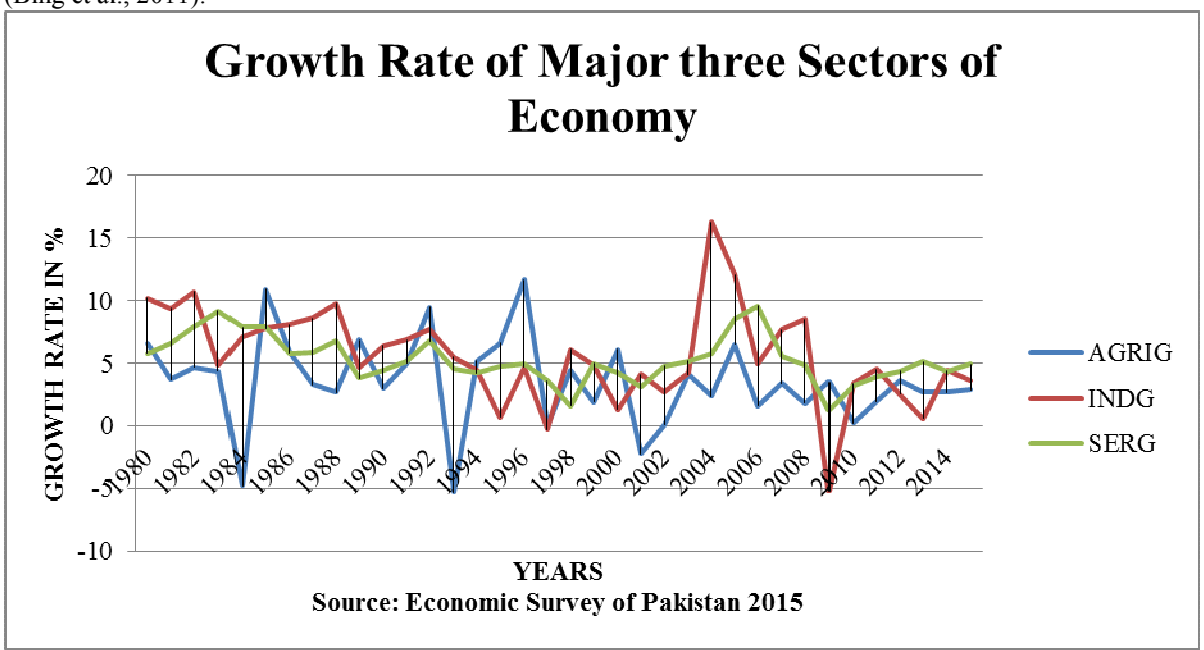
Figure 0.1: Growth in Agriculture, Industrial and Services Sector

agriculture sector and the industrial sector is a complex concept. In this scenario, it is difficult to find out the significance of a specific sector from all three sectors of the economy (industrial, agricultural and services sector). The concept of services sector is a modern concept in economic development because most of the businesses relate to the services sector. In previous literature, there was no difference between products and services, but the products provide services to consumers (Das et al., 2012). Where the agriculture and industrial sectors have greater importance, the services sector also plays a vital role in economic development. Agriculture and industrial sector provide the raw material, foods; contribute in trade, employment and final goods, but the services sector plays its role in managing all the resources in both of these two sectors (agriculture and industry) (Bing et al., 2011).