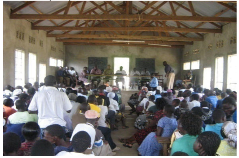
Plate 2: Women and the Youth during Abindu Community Awareness Creation.

The City Council of Kisumu's Tourism and Heritage Department took interest in Abindu site in the year 2011 and ever since has not looked into the ways of supporting the host community. The community around Abindu site has since realized that they have in their possession a very important ecotourism resource that is located very close to a commercial hub in the form of Kisumu City and the expansive fresh water Lake Victoria. They have an organized Community Based Organization (CBO) through which they make management and planning decisions on how to best develop the site (Plate 2). In this regard, the County Government of Kisumu has allocated funds in the 2014 financial year to cover some of the development plans for the site.In terms of the empowerment framework, the study analysed the situation in Abindu as follows: