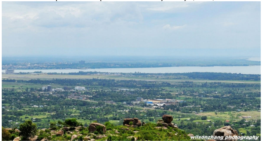
Plate 1: View of Kisumu City and Lake Victoria from Abindu site.

The site is located 12 kilometers, North-West of Kisumu City in Kisumu County on the Eastern shores of Lake Victoria in Western Kenya. Lake Victoria was formed by Intense tectonic movements during the rift valley formation (Gregory, 1965). The Nyanzaian rock system is the oldest rock in the region, the largest being a triangular block in Kendu-Oyugis-Kabondo (Ojany&Ogendo, 1973:22). The overburden consists of reddish, silty sandy clay deposit, and a superficial organic soil underlain by laterite soil with gravel and pebble inclusions. The granodiorite basement rock in the area is a member of Muriu Granodiorite intruded into the oldest rock of Pre-Cambrian Nyanzian meta-volcanics. Abindu rock is a curanotic tor similar to Kit-Mikayi in Seme Sub-County that has more or less similar religious and cultural significance. The rock tors are spatially distributed along the lake region such as Muhonge Murwe 'the crying stone', Gangu Nyalaji and Tororo plug. They are erosional features formed due to gradual denudation processes over long span of time. Abindu hills are remnants of granitic tors that extend up to Nandi Escarpment in the Rift Valley of Kenya (Plate 1).