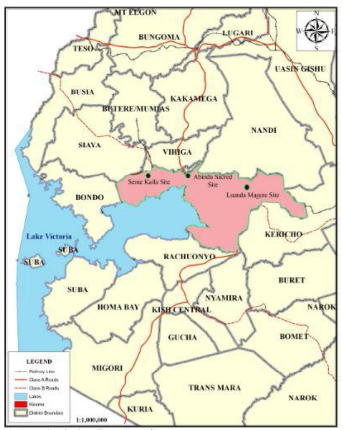
Fig. 1: Location of Abindu Site in Kisumu County, Kenya.

The density population is 828 per sq km. with an average growth of 5% largely due to rural urban migration. The population is projected to be 1 million by the year 2015 with the international airport, Kisumu is expected to post higher population.