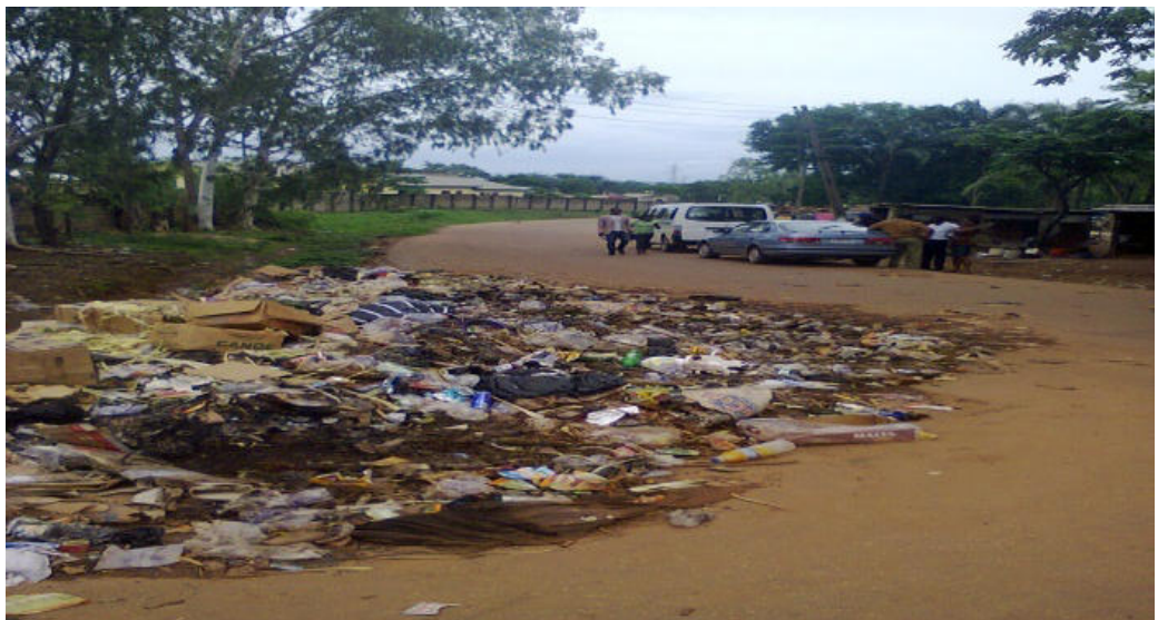
Figure 1 The state of most dump stirs in the streets as at December30, 2013

Step 3: Over 40 streets dump sites were visited within Enugu urban to ascertain the true position of collection and disposal of solid waste. The final dump site at Agu-Owor in Ogui Nike along Port Harcourt Express was also visited.