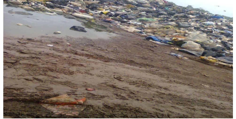
A sectional view of ESWAMA landfill at Agu-Owor, Ogui Nike

Figure 1  The state of most dump stirs in the streets as at December30, 2013