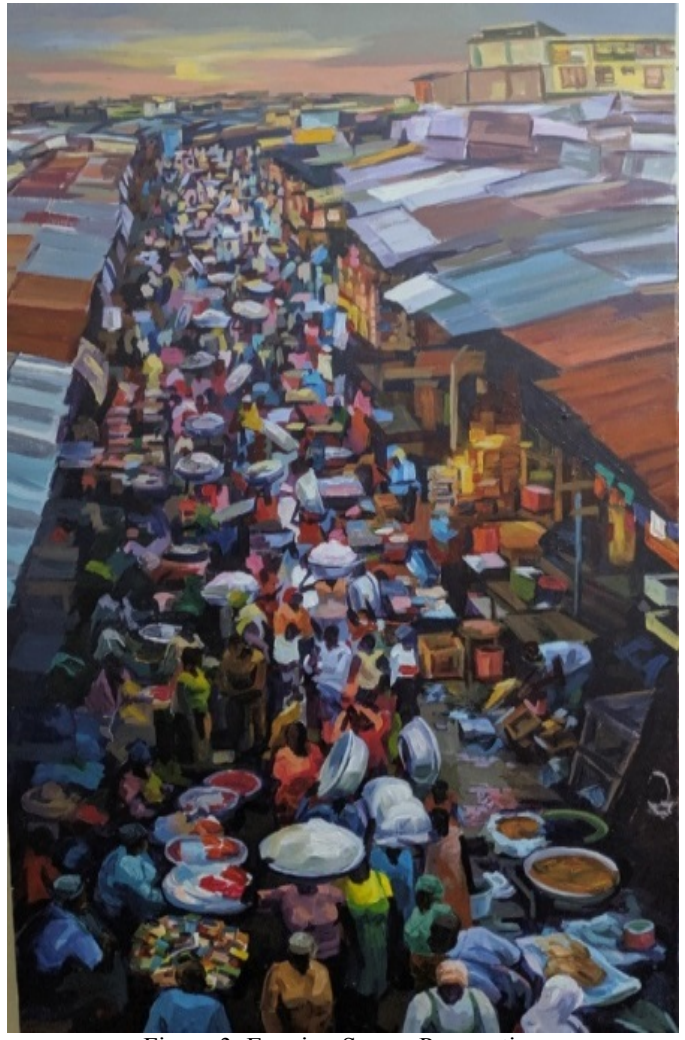
Figure 3. Evening Scene: Preparation