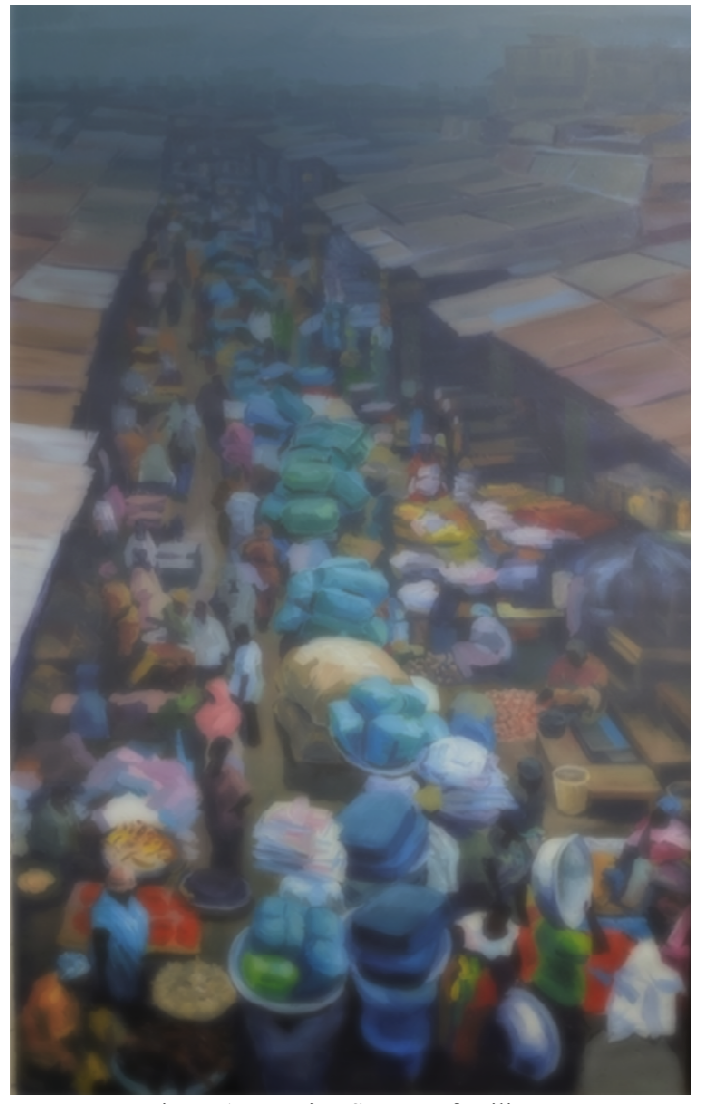
Figure 1. Morning Scene: Infantilism