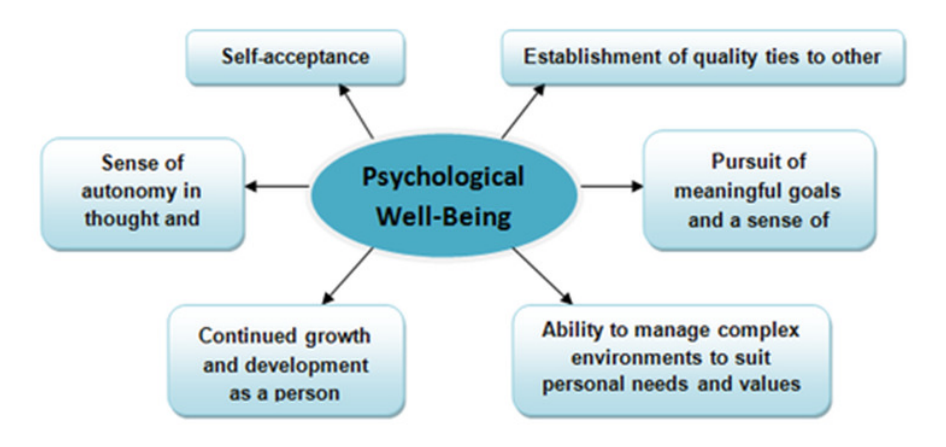
Fig.1.1 Psychological Well-Being.(Ryff's Psychological Well-Being)

Self-acceptance is the most recurring and fundamental feature of mental and an element of optimal functioning in the psychological wellbeing.