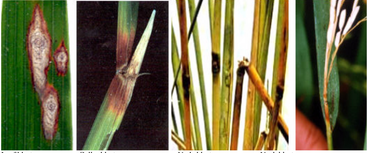
Leaf blastCollar blastNode blastNeck blastFigure 2: Development of blast symptoms on different above ground parts of rice plant