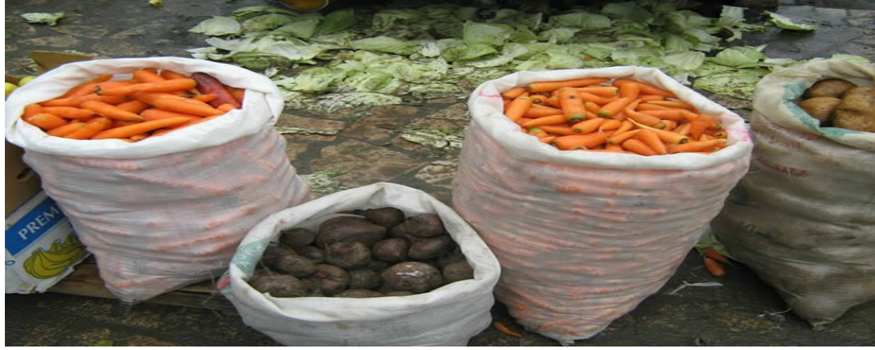
Figure1. Inappropriate packaging