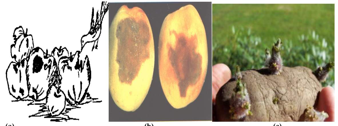
(a) (b) (c) Figure 3. (Biological and microbiological, chemical and physiological losses respectively)