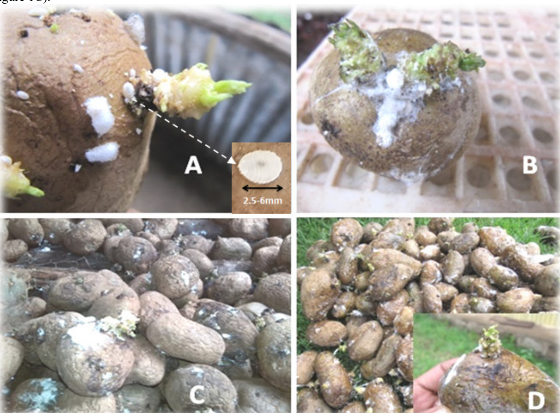
Figure 1. Pictures taken in DLS stores at different stages of the infestation. A-when adult Mealybugs feeding on the sprouts; B- Mealybugs formed white thread like webs on the sprouts; C-Sooty mold fungus on severely infested tubers and D-waxy honeydew excretions on the surface of infested tubers.

The pest was not appearing on fresh tubers when it brought in to the store after harvest. However, it came into view later 4-5 month of storage when tubers were sprouting. The level of the infestation has increased with time as the pest multiplied rapidly feeding on the sap from sprouts. The insect had white mass of cottony like cocoon which appeared in different developmental stages (instars) having different body sizes (Figure 1A). Adult Mealybug bodies are distinctly segmented and usually covered with wax. Older individuals may have wax filaments around their body margins. In some species the filaments are longer in the rear and can be used to help distinguish between different species. The pest forms white mass of thread like web on the surface of the sprouts, which is probably the protective case where the females lay their eggs inside (Figure 1B). It is more likely to see high population of the pest on the sprouted tubers placed in piled thick layers as the pest likes to feed in colonies usually between tuber touches in protected areas. Besides, it was not uncommon to see honey dew like fluid on the surface of the tubers where the infestation was severe (Figure 1D). In a bad infestation, their waxy excretions (also known as honeydew) encourages the development of sooty mold fungus which later causes tubers rotting. (Figure 1C).