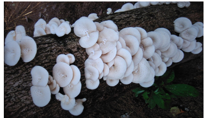
Fig. 1: Pattern of arrangement of P. oestratum on an old Avogado pear ( Persea Americana ) at the Rivers State University Agricultural Research Farm, Port Harcourt, Nigeria, 2016.

Many insects associated with the edible mushrooms in the Niger Delta of Nigeria cause a cosmetic damage to the fruiting bodies of the mushrooms affecting their yield, beauty and their marketability. Fig. 1 shows the attractive arrangement of P. oestratum on an 18-year old Avocado plant. The display of the edible mushroom on old tree stumps and on woods parked as firewood showed attractive overlapping arrangements of their fruiting bodies.