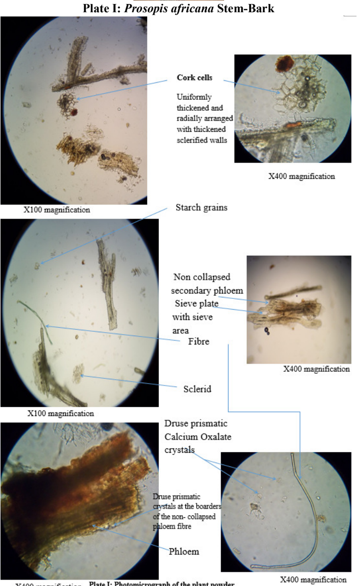
X400 magnification Plate I: Photomicrograph of the plant powder