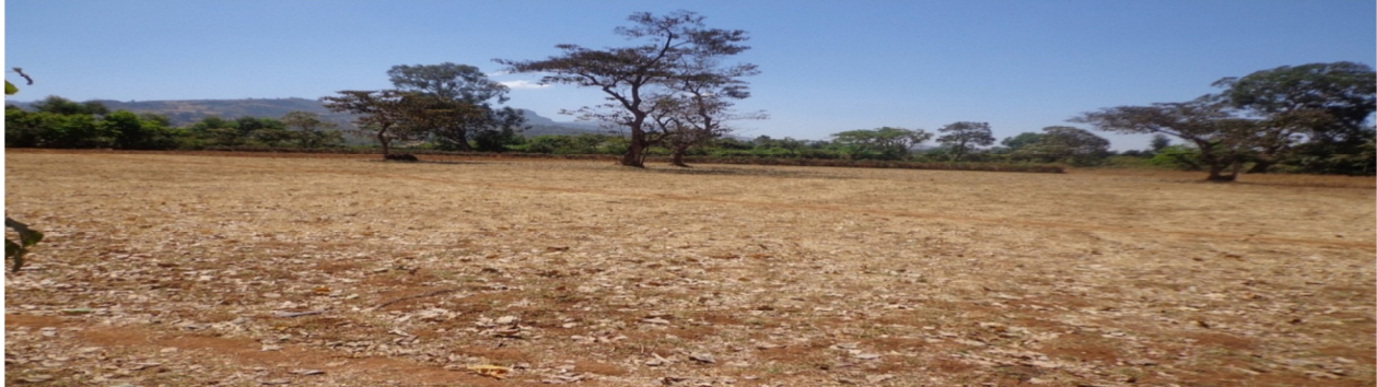
Figure3. Totally removed tef residue from the field in Limu Seka district