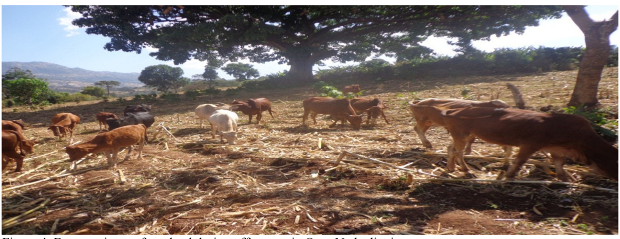
Figure 4. Free grazing on farm land during off season in Omo Nada district 3.4.5. Physical soil and water conservation measures

Physical measures are structures built for soil and water conservation by considering some principles that aimed to increase the time of concentration of runoff, thereby allowing more of it to infiltrate into the soil; divide a long slope into several short ones and thereby reducing amount and velocity of surface runoff; reduce the velocity of the surface runoff and protect against damage caused due to excessive runoff (Tidemann, 1996).