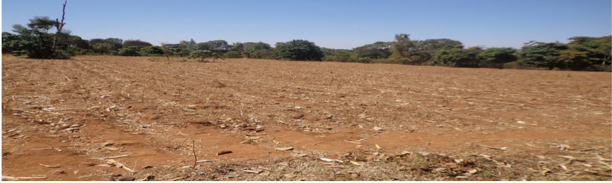
Figure 2. Totally removed maize residues from the field in Gera district

That means there was free grazing on the farm land after the crops were harvested. This result indicates that the crop residues left on the farm land were grazed by the animals and nothing were left on the ground. In addition to this, the animals trampled on the farm land so that, soil erosion could be aggravated.