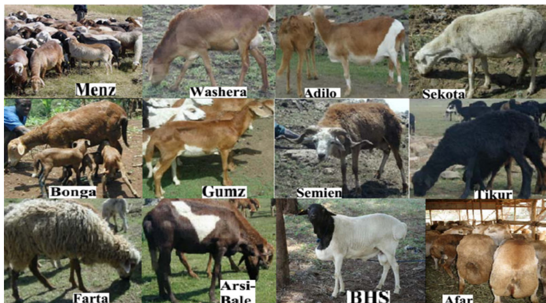
Figure 1: Physical characteristics of sheep types in Ethiopia