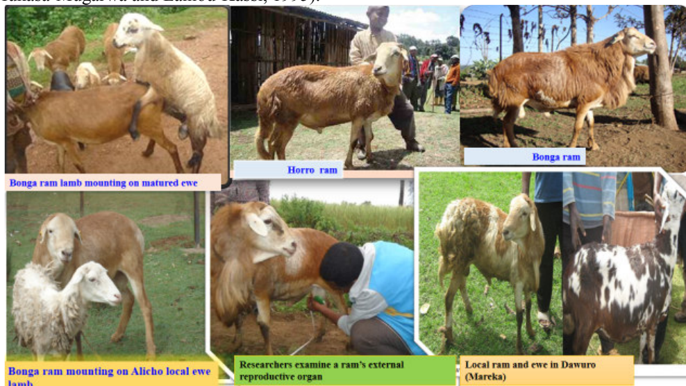
Figure 1: Sexual activity in Male

However, Rams of Ethiopian sheep breeds experience a depression in their fertility during the rainy season (Mukasa-Mugarwa and Lahlou-Kassi, 1995).