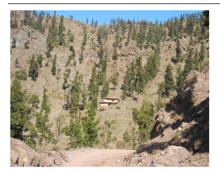
Figure 4 A degraded oak forest in the study area(village Badhal (Kotranka)