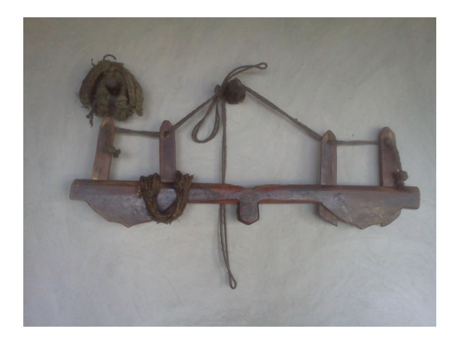
Figure 3 A yoke (a farm tool used with plough) made of Quercus leucotrichophora