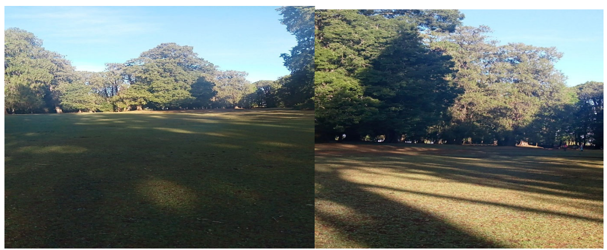
Figure 2: The Sacred site of Ogepecha

Chisite is the annual celebration dedicated to honor Oget with great gatherings from Hidar 20-21 (November 29-30). This festival has been the great rallying point of the Sebat-bet Gurages coming from different corners. People who are from far away areas arrive to the site of Ogepecha one day before the event. They spend the whole night praising Oget. Field observation revels that, when attendants come to celebrate Chisite, they bring a variety of gifts like umbrella, honey, bulls, and cash. After a while, Zuryashwork Zerga, the woman who is the representative and intermediary of Oget, comes from Abeze area of Yejoka accompanied by her husband, Damo Tseklel Asfaw. Her arrival is welcomed with great shouting by the attendants as if feeling the actual presence of Oget. They shout by saying waq chenem (Waq has come).