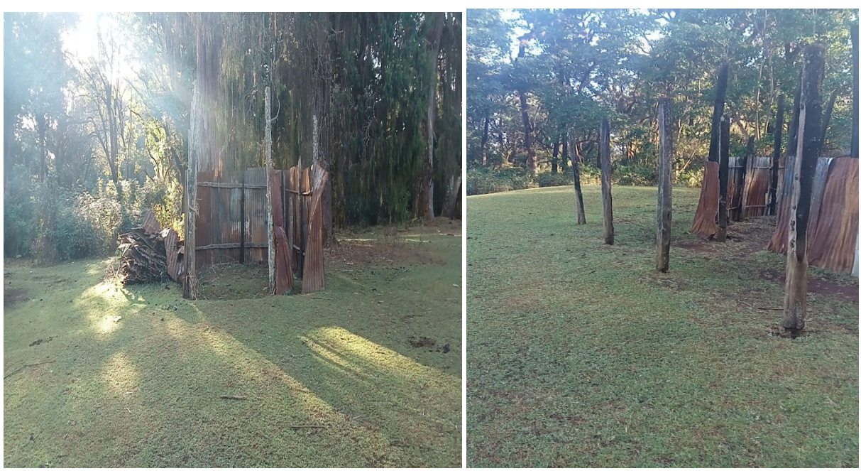
Fig 4: Burnt Waq Zeger (temple) in Ogepecha