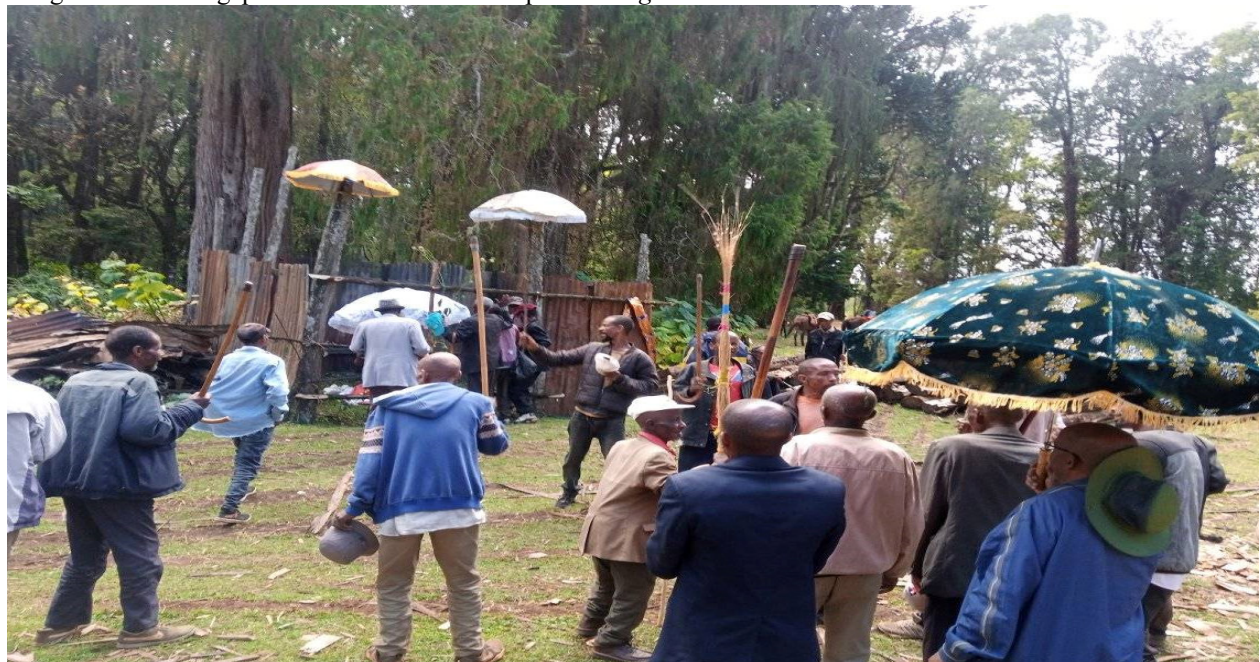
Figure 3: Attendants of Chisite , offering gifts to Waq's representative

After sitting half an hour under one of the Adebar tree, she gets up and moves around, accompanied by believers offering praise. Finally, she enters Yewaq zigur to accept gifts brought to Oget after the attendants tell her their problems and beg Oget for mercy and solution. Around the end of the festival, bulls brought by attendants are slaughtered in front of Ywaq zeger (Waq's temple). There are people who are given special authority to slaughter bulls in Ogepecha. The attendants and priest of Oget has their own share of the meat.