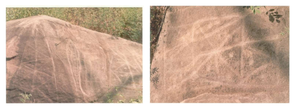
Figure 2. The petroglyph comprises three separate designs.

was to attend a function and could not, such sceptre was sent and full respects were accorded the representation. This sceptre, which represents the paraphernalia of Yoruba and Bini Obas further, adds to the close linkages of the cultural history of the Yorubas and Binis. Moreover, given the formal qualities and features of Ifa and the place of Ifa in Yoruba's ancient philosophical thought, the point deserving of archaeological and philosophical investigation is the hermeneutic meanings of the petroglyph. Additionally, while the historical linkages of the Binis and Yorubas are well documented, there is a philosophical gap in their thought systems, which closer research among philosophers and museum archaeologists may unearth. This suggests an unrestricted, connected and collaborative speculation among traditional thinkers in this part of Africa.