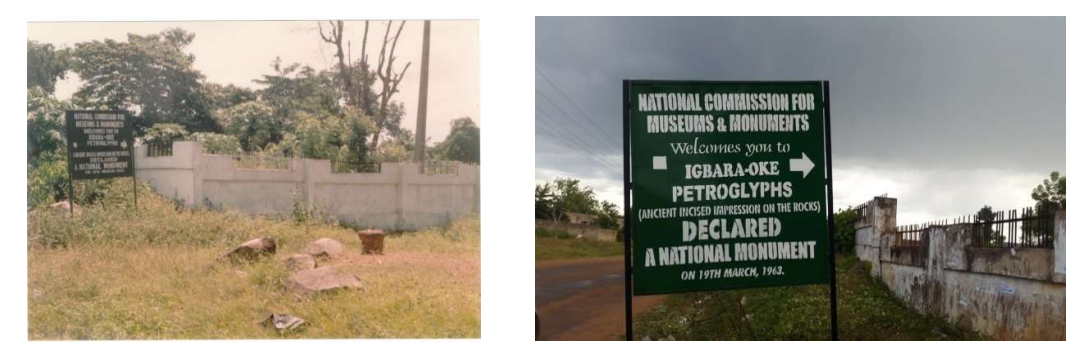
Figure 3: Approach to the petroglyphs.

This demonstrates some commonalities in the philosophical traditions dominant in the ancient period. But given the theoretical poverty of museum discourse, such possible speculation is not only arrested, there is a disconnection between museum artefacts such as the petroglyph and the sources of traditional philosophical speculation. The consequence of this is the conception of the museum as a static discourse, which has no bearing on the