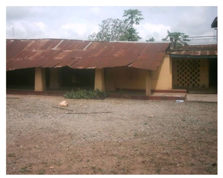
Figure 6. Inside view of the Palace.

The king's palace is found at the central hub of Akure City. Mostly in Yoruba towns, the king's palace forms the beginning or source of growth, with other developments spreading out or surrounding it in a radial formation. Louis Kahn refers to the city core area as 'the cathedral of the city' and an essential part of the urban movement (Khan, 1998:182). Looking at the contemporary status of Akure as the present capital town of Ondo State, the king's palace at the present state represents an archival jewel or antiquity rather than the contemporary status of a modern town.