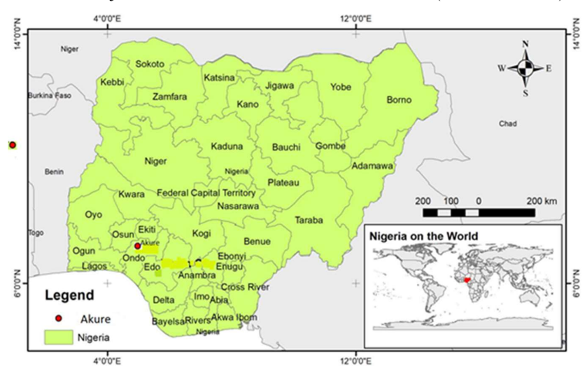
Figure 1. Present-day Nigeria, showing Akure. Adapted from Odeyale (2023).

On the world map, Akure (see figure 1) can be found on latitude 7 \Box 15 ' East of the Greenwich Meridian. Akure, in the present dispensation, is the capital of Ondo State, Nigeria. It is situated 204 kilometres east of Ibadan, 168 kilometres west of Benin – City and 311 kilometres North-East of Lagos13, and it is also regarded as one of the North-Eastern Yoruba districts (Akintoye 1971, Weir 1993). Lagos was the former capital town of Nigeria and Ibadan is a major and notable town in West Africa. On the other hand, Akure doubles as the Local Government headquarters and was made the provincial headquarters of Ondo province in 1920 (Odeyale 2009, Weir, 1993). The residences of the Obas palaces of the Yoruba are regarded as the matrices of Yoruba culture, which in essence implies that everything around the palace symbolizes the cultural ebullience of the Yoruba people. The Akure King's palace is popularly referred to as the Aafin Oba. The Federal Government of Nigeria declared the Akure King's palace a national monument on 2nd November 1990. It was intended that the Museum of National Unity situated in the expanse compound of the palace would oversee the preservation and maintenance of the palace. Palace has in addition to its architectural, historical and aesthetic importance, a traditional role as the custodian of values, artefacts, relics and objects; this formed its vital link to the Museum (Al-Hassan, 1995).