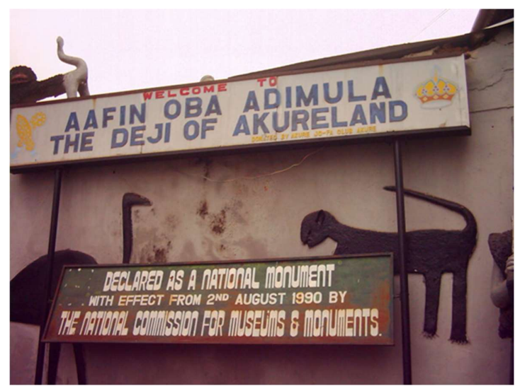
Figure 7. Part of the decorative motifs at the front of the Palace.

traditional abode of the traditional ruler of Akure. Akure concentrated on the three-dimensional composition of the palace. The many levelled surface of the site was exploited with true virtuosity and perfect judgment in the composition of every courtyard of the Afin". The builder of the palace made use of the spatial possibilities offered by the undulating nature of the terrain contour to achieve changes in the level of the buildings that constitute the palace. The making of the individual components of the palace (the courtyards and the traditional offices, chambers and grottos) was done with a pure sense of adventure on the part of the designers. The designers made use of the terrain to create interesting stepped entrances into adjoining parts of the palace.