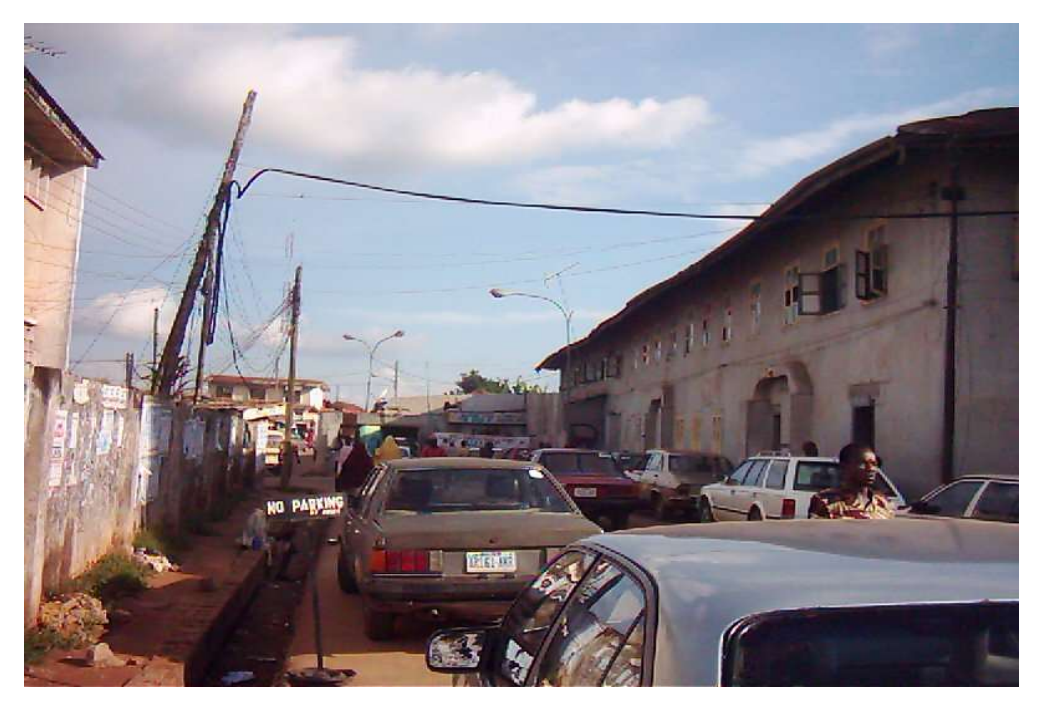
Figure 4: Ancient King Palace at Akure – declared a National Monument – over 900 years old.

contemporary attempts to reconstruct the history of speculative thought in traditional African philosophy. Our point is that given the arrest of the modern African intellectual traditions museum discourse and practices are an area, which ought to offer the intellectual space for the necessary reconstruction and linkages with more contemporary thought and intellectual traditions.