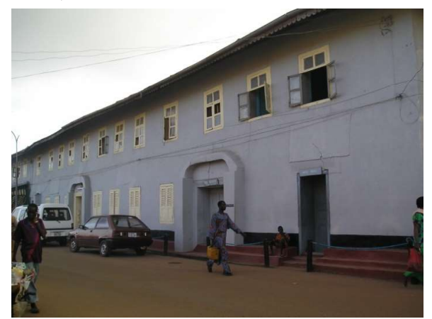
Figure 5. Akure king's palace is referred to as the Aafin Oba.

The unexamined Deji's Palace as a museum artefact offers a different illustration of the reading of museums in Nigeria. Given the virtual absence of city and town life; the social and physical crisis of urban development due to a non-reflective apprehension of the demands of a transition from serene small-town life to a more complex urban and city life the location of the Deji's palace in the city of Akure offers an archaeological template on the organization of town life dated to the ancient period. The Deji of Akure palace is the residence of the Deji (King of Akure) (see Figures 4, 5 and 6).