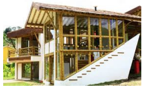
Plate 7: Bamboo as fabric and structural support for building. Source: MT Bamboo Plywood, 2020

1. Modern technologies could be adopted in dry walls construction with the use of local materials such as bamboo as the structural elements. This would reduce the cost of production as it is not as bamboo is not as expensive as concrete and steel reinforcements.