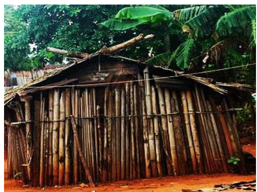
Plate 5: Effect of incessant rainfall on bamboo wall.