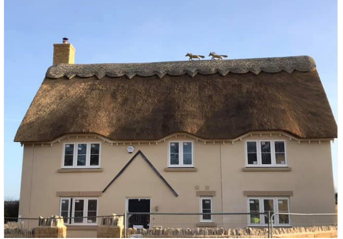
Plate 10: Thatch roof used as roof covering.