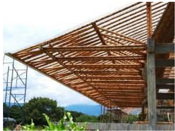
Plate 8: Bamboo as roof structural members

Apart from these, the use of bamboo for wide overhangs due to its high tensile strength can be used to protect abrasion on laterite or mud wall when used as building walls. It can also be used as roof members with a careful use of modern construction methods.