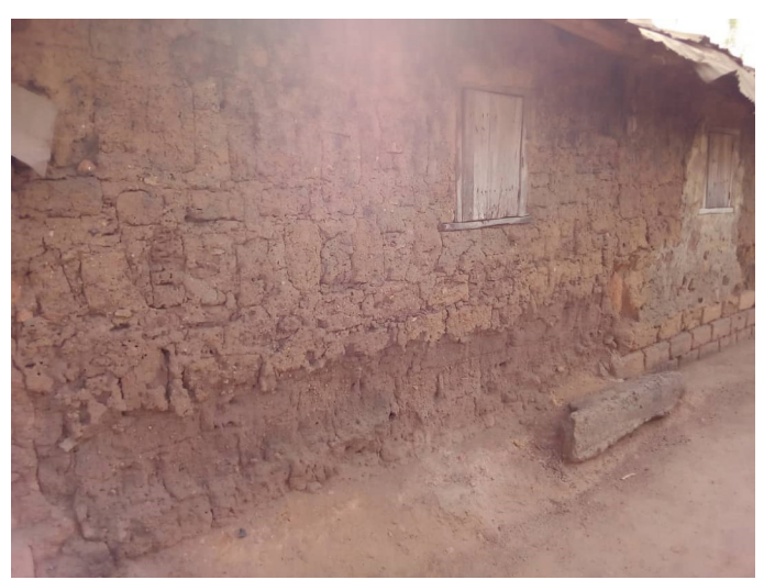
Plate 2: Abraded surface of a wall constructed with laterite: Authors Field work, 2019