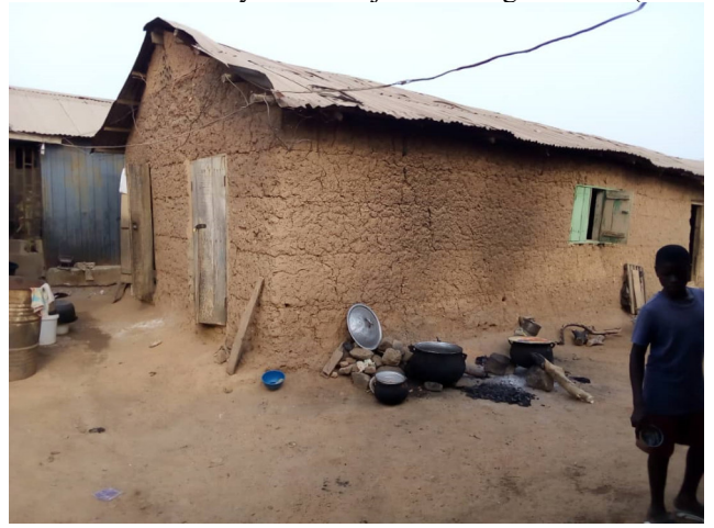
Plate 1: Reddish brown surface of a wall constructed with laterite: Authors Field work, 2019

of laterite walls easily get abraded and washed away when subjected to high rainfall (Osasona, 2005).