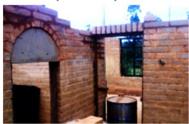
Plate 11: Compressed earth blocks for wall made from the mixture of cement and laterite.

4. Compressed earth block is seen as one of the ways local materials have been improved. This according to Opaluwa et al., (2012) is the process of mixing natural laterite with certain percentage of cement or lime to produce compressed earth blocks. The addition of little cement would take care of the weakness of laterite. It was however been noted that building made with compressed earth block tends to have the strength to carry impending loads by the roof than the wattle and daub methods used by the vernacular system.