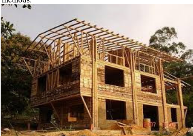
Plate 9: Bamboo as roof structural members and column supports

Apart from these, the use of bamboo for wide overhangs due to its high tensile strength can be used to protect abrasion on laterite or mud wall when used as building walls. It can also be used as roof members with a careful use of modern construction methods.