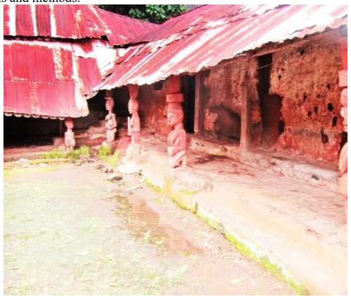
Plate 6: Abandoned Yoruba vernacular architecture at Idanre town, Ondo state, Nigeria.

However, absence of maintenance culture and lack of technological advancement to meet up with the new demand of people are major challenges Yoruba vernacular architecture is faced with and this has caused a drastic shift to foreign materials and methods.