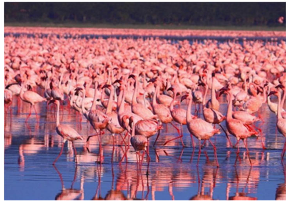
Figure 1. Lake Nakuru National Park.

Kenya is endowed with many tourist attraction resources including the ocean and lake beaches in Mombasa, Lamu, Malindi, and Kisumu, deserts (Chalbi and Nyiri), beautiful rain forests like Kakamega forest, grasslands, coral reefs at the Coast, islands like Mfangano, The Great RiftValley, beautiful tribal cultures among others. The majority of these natural resources aren't utilized for international tourism except for the beaches on the Coast of Kenya. Besides this, wildlife continues to be a major tourist attraction in Kenya. According to World-Bank (2010), besides the big five animals, Kenya has more than 500 and 359 birds and animal species in a 47,674 square kilometers pieces of land of national parks, game reserves, wildlife sanctuaries and wildlife conservancies spread across the country. There is however underutilization of these resources as most of them in the rural areas are not marketed and therefore attract few tourists as 80% of the tourists do visit 7 parks only, therefore leaving all the other parks and reserves underutilized (GOK, 2017; World-Bank, 2010). With large bad species, Kenya has the potential to be a tourist destination for bird watchers and trekking activities around Mount Kenya. Flamingos, shown in figure 2. have attracted a significant number of tourists to Kenya being an important tourist attraction in Nakuru County.