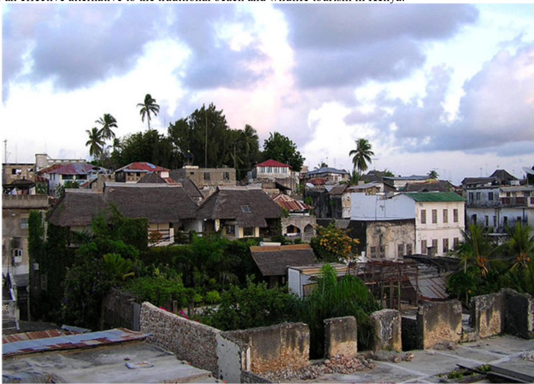
Figure 2. Lamu Old Town (Chantal, 2018)