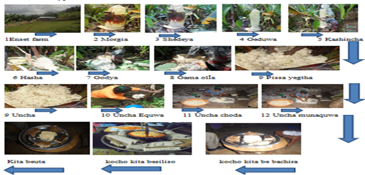
Figure 4 the role of female in Kocho bulla and fiber processing value chain

Chopping Enset and processing kocho, bulla and fiber from it was significantly affecting the volume of kocho and bulla obtained from single plant at 5% level. In current research data analysis value addition activities or chopping performed by female group and during this time female cut the Enset plant by knife and the outer stem coverage separated by small pieces, then the separated stanch locally known as "kashincha" was obtained from pseudo stem (the scraped leaf sheaths) locally call it "Morgiya, shedeya, geduwa" and "godetha uncha" which made from the inner or underground stem exasperated corm mixed together with fermented Enset yeast or locally called as "Gama" and finally it results processed kocho. Bulla is also obtained from chopped kashinch through wrapping and the white-colored starch concentrate is mixed with the very soften yeast of the fermented Enset gama and covered with leaf of Enset and stored in selective place at least 20 days and at most 4 months and above for consumption and marketing purpose. In such value addition activities female plays significant role. The kocho and bulla processing and its value addition by female group from poketha (separating the steam of Enset into different parts such as Morgiya, shedeiya giduwa and kashincha are indicated on value chain map figure 1 blow. Enset processing is carried out by women using traditional tools and the process is laborious, tiresome, and unhygienic. J. Terrence et.al, 1997.