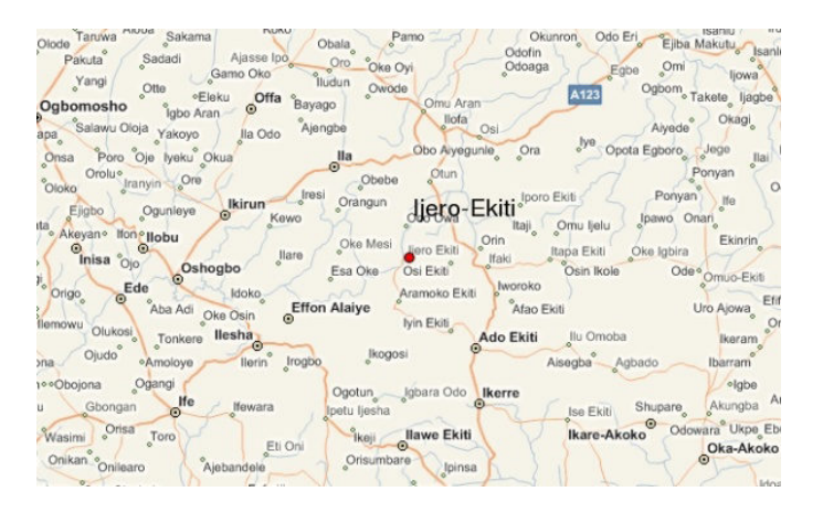
Figure 1: Map of Ijero - Ekiti

Compressive strength is a measure of the stress at which a material fails under load. Brittle ceramics display much higher strengths in compression than in tension (on the order of a factor of 10), and they are generally utilized when load conditions are compressive (Callister, 2000). Attempt is being made in this research work to explore the use of kaolinite clay from Ijero using sodium silicate as a binder and then model the dry compressive strength property, Ijero is located in coordinates 7° 49'N and 5° 5'E in Ijero-Ekiti local government of Ekiti state, South West of Nigeria as shown in Figure 1.