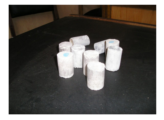
Figure 2: Sodium Silicate Bonded Kaolin Refractory Bricks

The compressive strength is calculated using equation (1):