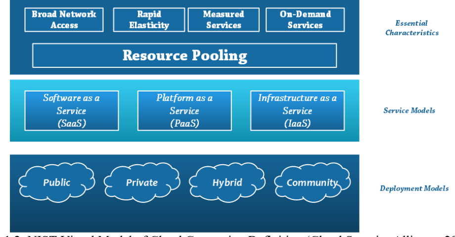
Figure 1.2: NIST Visual Model of Cloud Computing Definition (Cloud Security Alliance, 2011:15).

NIST defines cloud computing architecture by describing five essential characteristics, three cloud service models and four cloud deployment models (Cloud Security Alliance, 2011: 12). They are summarized in visual form in Figure 1.2