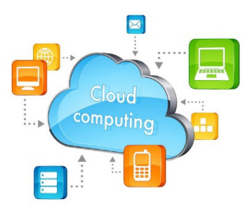
Figure 1.1: Diagram of Cloud computing concept (AG-Placid Limited 2013)

Cloud computing is a concept that is broadly recognised by Nigerian businesses and government agencies, but not always well understood in detail. To some degree, this is basically because of the continuing rapid evolution of cloud computing service offerings. "Cloud computing" is a technology term that is most often ambiguously defined. Although there are various definitions of cloud computing all aimed at giving understanding to the concept of cloud computing, the researcher has decided to use the definition of cloud computing by the U.S National Institute of Standards and Technology. NIST (2011)<sup>1</sup> defines cloud computing as: