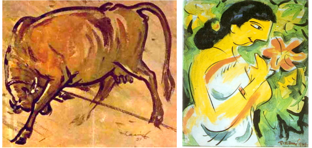
Struggle by Zainul Abedin-1969

Through their style of art and system of education, the modern practice of art started in Bangladesh, in the former East Pakistan. Among them, Zainul Abedin, Safiuddin Ahmed, Anwarul Huq (1918-80), Khwaja Shafique Ahmed (1925-?) and Quamrul Hassan (1921-88) were creative artists whose names are worth mentioning. The works of the artists in the forties is the attempt to reflect the nature of the native land and the life and livelihood of the common people. Although the Bengal School was then dominant in the Kolkata-centric practice of art, these artists did not accept its religion, mythology, and history based subject; however, they practiced some aspects of this style. The city life also did not have much attraction for them.