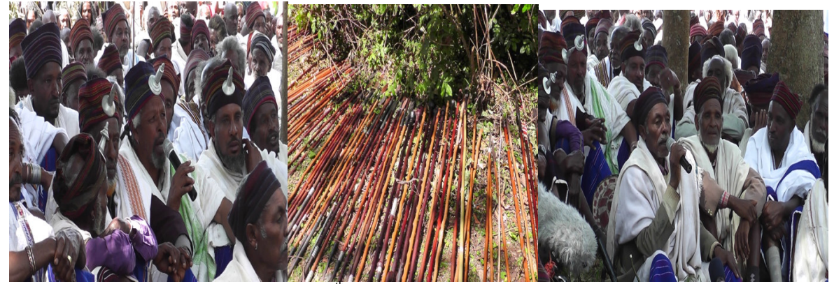
Fig 4: 74<sup>th</sup>Gumii Assembly at Me'eeBokkoo

As Gujii elders narrate, the assembly takes five consecutive days before power transition. Each day, members of different Gadaa classes such as Gadaa , Doorii and Raabaa members of Uraagaa,Maattii and Hookkuu confederacy move in line to the center of meeting or ' Agaalla '[40]. There are two travelling roots. The first leading segment is belongs to the line of Gadaa members of the three confederacies orderly keeping their own line. The second segment is ' Doorii members of all three confederacies respectively and the third segment is ' Raabaa ' members of the three confederacies. During this Gumii traveling to the center of assembly various announcements are made, including travelling norms and other laws by the Yuubas . This speech continues up to the arrival of ' Gumii ' members to the ' Agaalla ' and formal discussion officially opened [41].