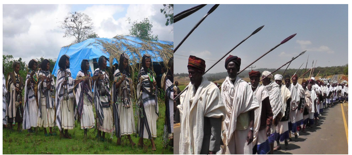
Fig 3: Both Gujii Oromo elder men and women marching to 74 th Gumii Bokkoo assembly

During the Gadaa power transfer, it is the women with the Siiqqee that blesses and decorates the ceremonies for the person who gives and takes over the Gadaa offices. Again, Ragatu quotes as 'The newly elected officials walk under the Siiqqee sticks raised up by women standing in two rows and touching the other tips of their Siiqqee together' [31]. Thus, both Gadaa and Siiqqee institutions helped to maintain Safuu (Oromo moral codes) of Oromo society. It functions hand in hand with Gadaa system and it has given big opportunity for Oromo women to articulate their views and address issues of concerning to women [32]. Generally, in the Gadaa leadership, women are actively engaged through Siiqqee institution and they deal with all aspects of their life [33], [34].