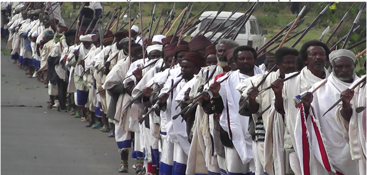
Picture 5: Gujii Oromo elders marching to Gumii Bokkoo during 74<sup>th</sup>Baallii transfer from Dhallana to Harmuufa . On their way to 'Agaalla', the walking approaches, wearing styles, spear holding sides and forms, walking speeds, passing norms, and other relevant issues are popularly announced to all to be respected. These announcements made by responsible 'Yubaa', who moving forth and back in passing Gumii expedition, being in each travelling roots. Throughout the stay of 'Gumii' assembly, these procedures, orders and norms are always kept and followed. If one misses it, the peace keeping 'Jaldhabaa' or Police will order him to correct it. In fact, these announcements always used to notify every travelling member up to the end day of general convention as 'Gumii' moves in same pattern [42].

As Gujii elders narrate, the assembly takes five consecutive days before power transition. Each day, members of different Gadaa classes such as Gadaa , Doorii and Raabaa members of Uraagaa,Maattii and Hookkuu confederacy move in line to the center of meeting or ' Agaalla '[40]. There are two travelling roots. The first leading segment is belongs to the line of Gadaa members of the three confederacies orderly keeping their own line. The second segment is ' Doorii members of all three confederacies respectively and the third segment is ' Raabaa ' members of the three confederacies. During this Gumii traveling to the center of assembly various announcements are made, including travelling norms and other laws by the Yuubas . This speech continues up to the arrival of ' Gumii ' members to the ' Agaalla ' and formal discussion officially opened [41].