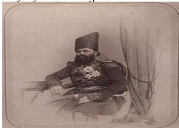
Figure 2: an Image for Mohammad Ghasem Khan Vali

The stone engraving is 520 centimeters high, 810 centimeters wide, and 700 centimeters deep. The stone is installed on the west wall at 250 centimeters above ground. The writing is in Kufi scripture. Letters stand out 4 centimeters from a relatively leveled and polished surrounding surface. The lines were not evenly spaced and the style of writing has given it a beautiful appearance.