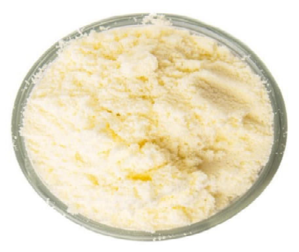
Fig 3 Dried milk in a bowl

According to K.N. Pearce and F, Glenn. (2018.) milk and milk products are often dried to less than 4 percent moisture to prevent bacterial growth and spoilage, to reduce weight and to extend shelf life. Two types of dryers are used in the production of dried milk products—drum dryers and spray dryers. The simplest and least expensive is the drum, or roller, dryer. It consists of two large steel cylinders that turn toward each other and are heated from the inside by steam. The concentrated product is applied to the hot drum in a thin sheet that dries during less than one revolution and is scraped from the drum by a steel blade. The flake like powder dissolves poorly in water but is often preferred in certain bakery products. Drum dryers are also used to manufacture animal feed where texture, flavour, and solubility are not a major consideration.