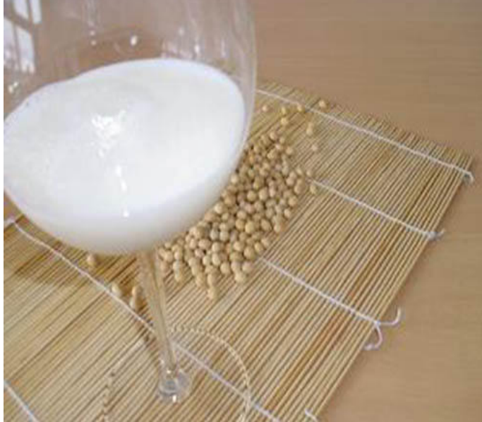
Figure 2: Soybean seeds and milk

The milk of animals that grow rapidly, such as cows, which double their birth weight in 50 days, is rich in protein and minerals; composed of 80 percent water, 5 percent fat, characteristic taste and texture, vitamins A, D, E, and K, as well as certain fatty acids. It contains many minerals, the most abundant of which are calcium and phosphorus and an excellent source of vitamins A and B<sub>2</sub>. Vitamin A, is found in the globules of fat and is removed when fat is skimmed away to make low-fat or skim milk.