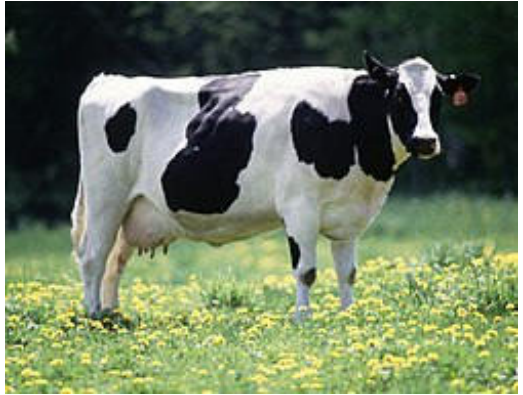
Figure 1: A Cow ready to be milked

The breast is a gland consisting primarily of connective and fatty tissues that support and protect the milk producing areas of the body. The milk is produced in small clusters of cells called areola which milk travels down to the nipples. Each nipple has 15 to 20 openings for milk to flow. Infant suckling or external pressure stimulates the nerve endings in the nipple and areola, which signal the pituitary gland in the brain to release two hormones, prolactin and oxytocin. Prolactin causes areola to take nutrients (proteins, sugars) from the blood supply and turn them into breast milk. Oxytocin causes the cells around the areola to contract and eject milk down the ducts. This passing of the milk down the ducts is called the "let-down" (milk ejection) IDF Doc. No.9002