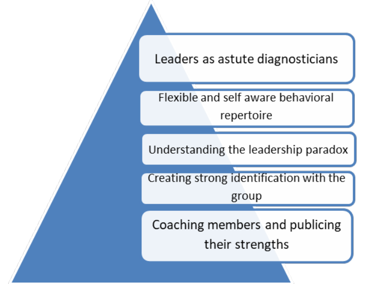
Figure 1: Organizational leadership models of psychological perspective – 1