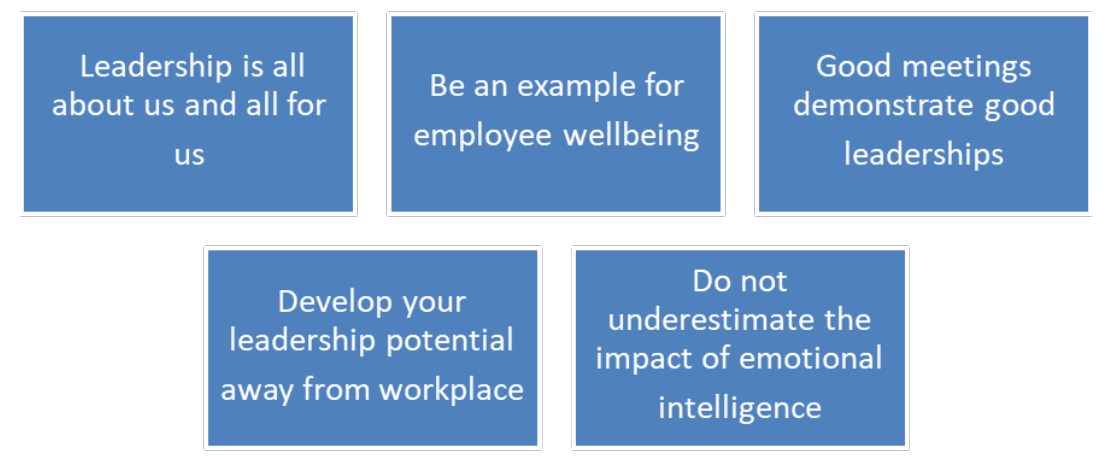
Figure 2: Organizational leadership models of psychological perspective – 2