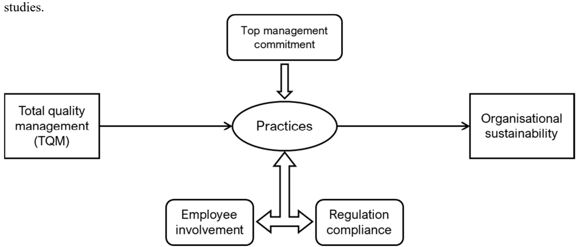
Figure 1. Conceptual framework showing TQM role towards organizational sustainability in SMEs

The proposed model Figure 2 suggested through this study offers a pathway for achieving sustainability in organizations especially in the context of SMEs and provides preliminary understanding and guidance to business establishment managers, decision-makers, and stakeholders, independent of the nature of business and operating structure in the organization. The proposed model is developed considering the validation of the hypothesis revealing that organizational sustainability is a combined input of TQM and sustainable dimensions in the organization, while each of the inputs internally is operated by indicators, internal factors that will influence the overall achievement of the sustainable goal. According to the model TQM implementation of practices are guided through external and internal drivers that are specific to every organization, those again depend on nature, size, business level, and organization structure combining with sustainability dimensions through the three levels together ultimately leading to achieving sustainability in the organization. Organizations that are marked sustainable are known to show consistent firm performance in design, product, quality, and customer satisfaction enhancing financial performance and improved business prospects among other business players in the market.